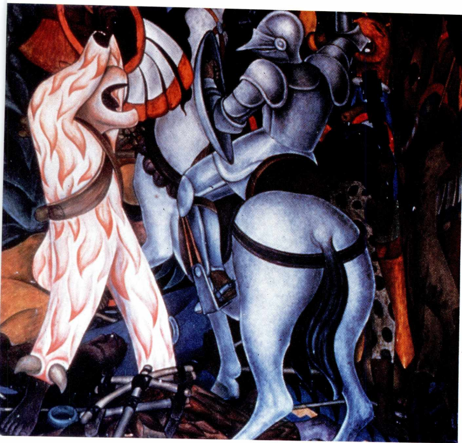
The Battle of Cuernavaca (detail), 1929-1930, Diego Rivera. (Palace of Cortés, Cuernavaca, Morelos.)