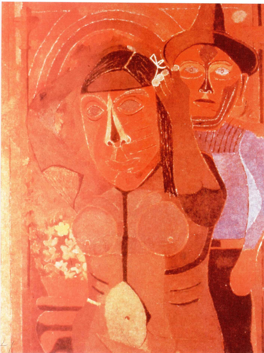
Carnival , Rufino Tamayo.

the pre-Hispanic presence in the muralist movement. This is extremely complicated, especially in light of the critical reappraisal of the Indigenous Nationalism of Mexican archeologist Manuel Gamio,