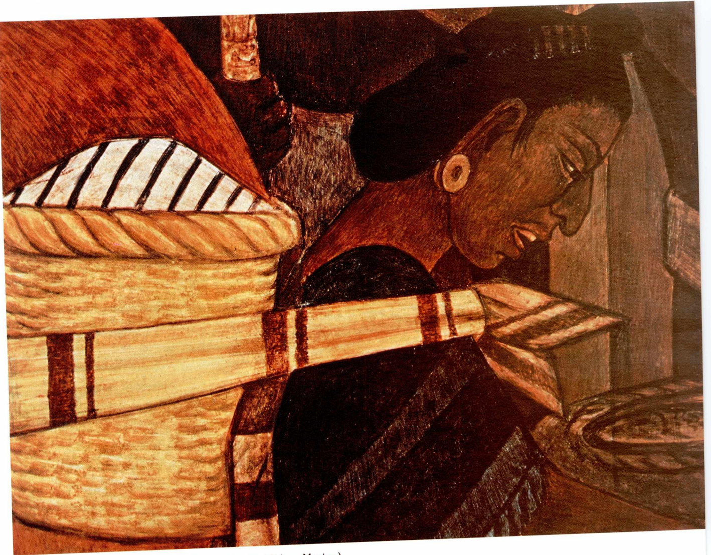
Great Tenochtitlan (detail), 1945, Diego Rivera. (National Palace, Mexico.)

Register of Tributes); b) post-Conquest codices, Sahagún, the Lienzo de Tlaxcala (Tlaxcala Canvas) and others; c) in addition, Catlin analyzed pre-Hispanic pieces that Rivera could have seen in the Museum of Anthropology and the ways they might have been incorporated into the mural.