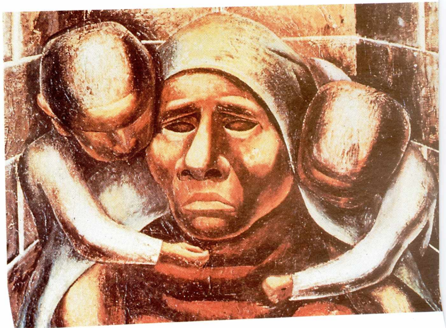
Proletarian Mother , David Alfaro Siqueiros.