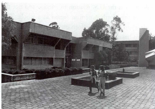
UNAM'S ENEP Acatlán offers a master's program in Mexico-U.S. relations.

I would like to conclude with some queries that I think are in need of immediate consideration: What role should universities and, in general, higher education play in Mexico in the economic opening? Which areas of study or disciplines will require reinforcement with economic modernization? Are we prepared for an economy which tends to become highly competitive and therefore demands accelerated training of the workforce? Are we facing a brain drain even bigger than the one we have already suffered? Should we promote teaching and research programs about North American studies in Mexico and about Mexican studies in the United States and Canada? Should we begin to formulate a plan for integrated trinational education? Is the ERASMUS Project, designed to allow for higher student mobility in European countries, an example we should follow for designing and defining our priorities in terms of education for the 1990s? Is this the moment to begin to plan our Academic Free Trade Agreement? And finally, to what point are we able to exploit the potential of greater academic integration without affecting our cultural values? ❧