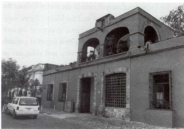
The José María Luis Mora Research Institute specializes in historical research.

that, without disregarding the wealth of past experience, it will be possible to reformulate positions, answers and strategies of analysis to understand our northern neighbors. It is important to avoid the two extremes into which most studies have fallen in the past: the emotional rejection of everything linked to the United States on the one hand, and, on the other, our total integration as a panacea.