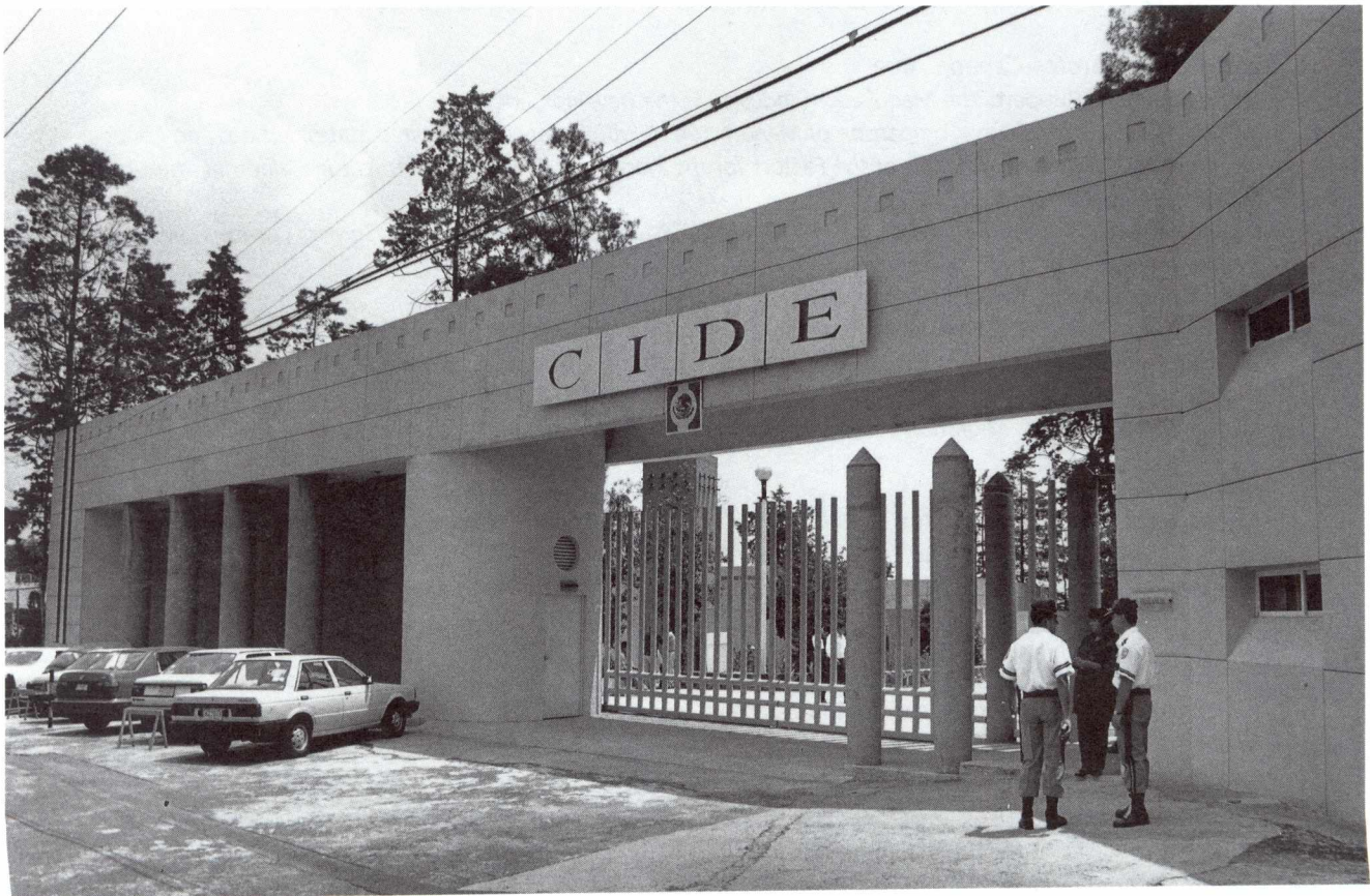
The Center for Economic Research and Teaching, through its Division of International Studies, promotes research on the United States and the integration of North America.

However, it is only fair to say that several universities, institutes, departments and centers have developed projects to analyze, even if in a limited way, some of the realities of North America, even though in the majority