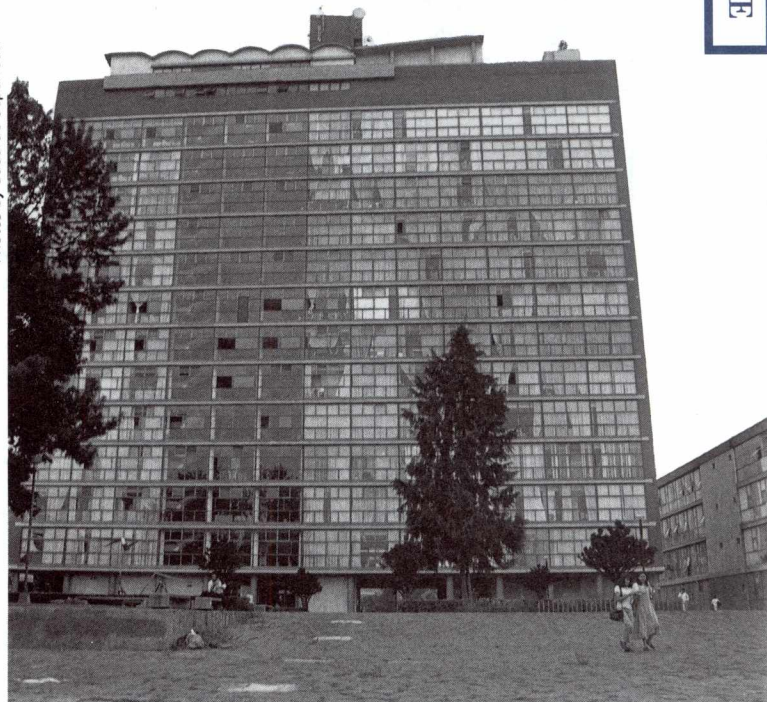
The UNAM Humanities Tower houses the CISAN offices.

Our efforts in Mexico to systematize the study of the region have gradually eliminated some misconceptions which came about mainly due to the lack of knowledge.