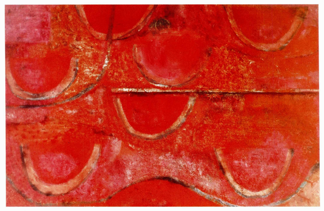
Watermelons, 1968 (oil on canvas).

but as an independent entity, with a life and problems of its own."<sup>3</sup>