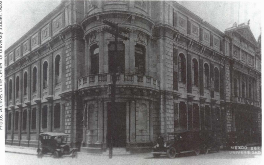
The National University in 1929, the year it became autonomous