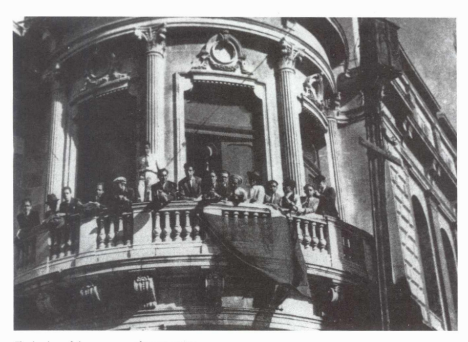
The leaders of the movement for autonomy.

Universities were born in the Middle Ages among the scholastics who determined and channeled their existence. From the very beginning, however, their history has been a struggle for freedom. This worldwide phenomenon was also determinant in the rise and development of the university in Mexico.