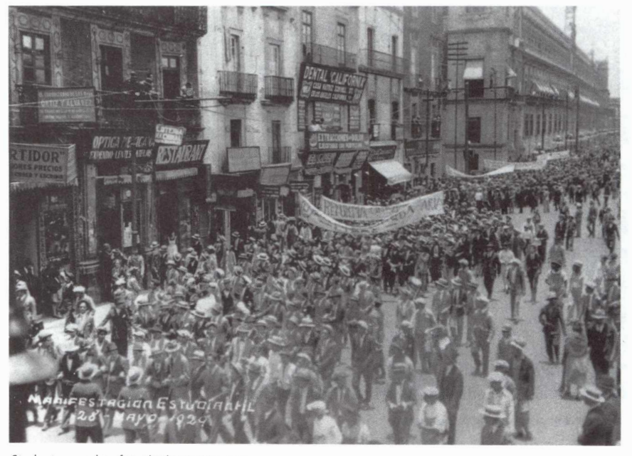
Students were key for winning autonomy.

In Mexico, the University Charter, which became law July 26, 1929,