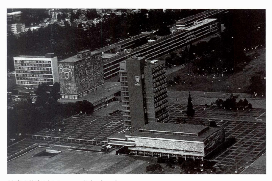
Mexico's National Autonomous University today.