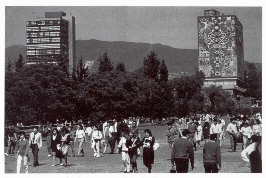
Today, autonomy is one of the basic values in Mexico's universities.

Autonomy must be a bulwark of institutions of higher education against the interest of political parties.