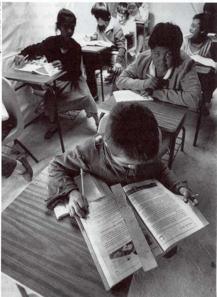
In Mexico's southern states (Chiapas, Oaxaca and Guerrero) very few children ever get to the university.