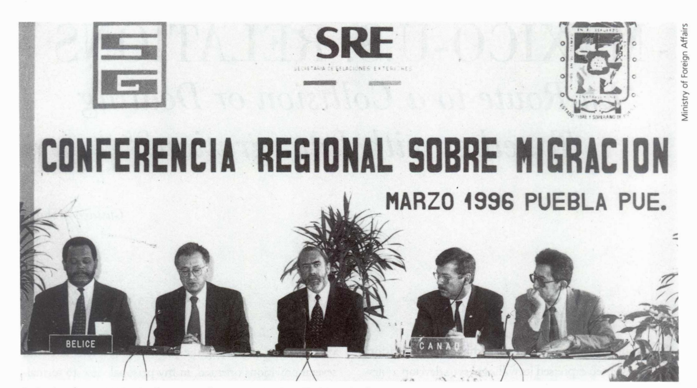
Regional conferences on immigration promote better understanding of its international nature.

mal daily contacts between public officials on both sides. Some could argue that trade, finance or even drug trafficking are more important topics, but I think that none of them represents as big a challenge to both countries as the migration of Mexicans to the United States.