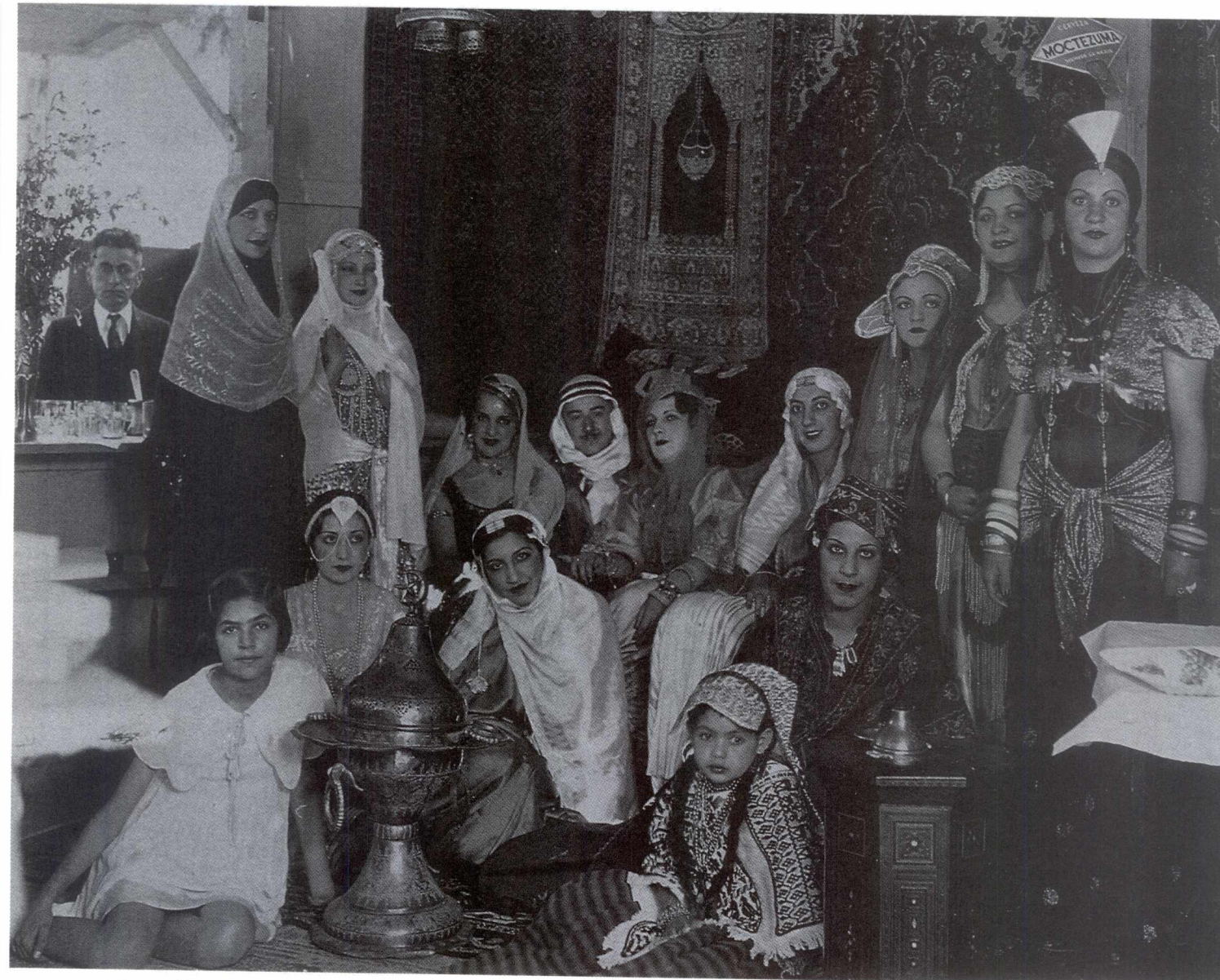
Lebanese immigrant women in sumptuous traditional dress.

In Mexico, Lebanese have played outstanding parts in culture, trade, industry and finance.