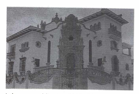
Lebanese architecture in Mexico.

shores like the revitalizing shadow of the legendary tree, emblem of the ancestral homeland. Wi