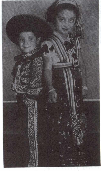
Mixture of cultures.