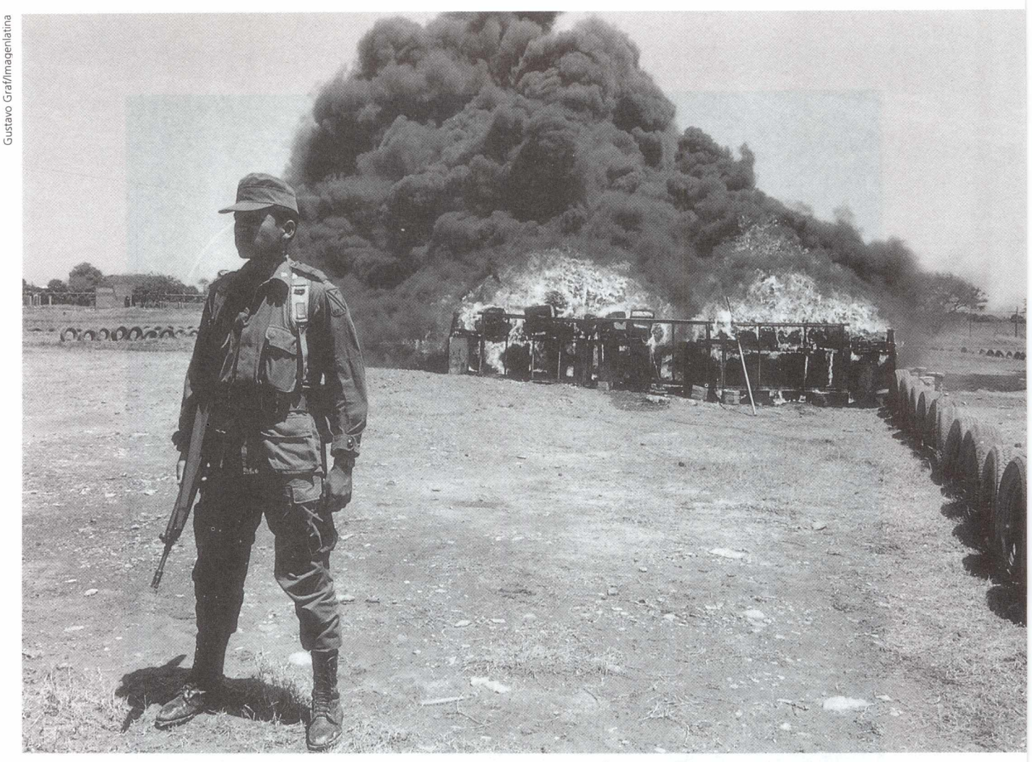
Authorities burn more than nine tons of cocaine and marijuana. Mexico has made a big effort in the fight against drugs.

ities and agencies were also applied within the United States. In particular, intensifying educational programs designed to reduce domestic drug consumption, carrying out major campaigns to eliminate marijuana fields in several U.S. states, prohibiting the production of synthetic drugs, controlling the flow of chemical inputs in the region, halting arms trafficking and seriously combating money laundering, which is mainly conducted within the United States and U.S. financial institutions.