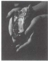
Lola Alvarez Bravo In Her Own Light