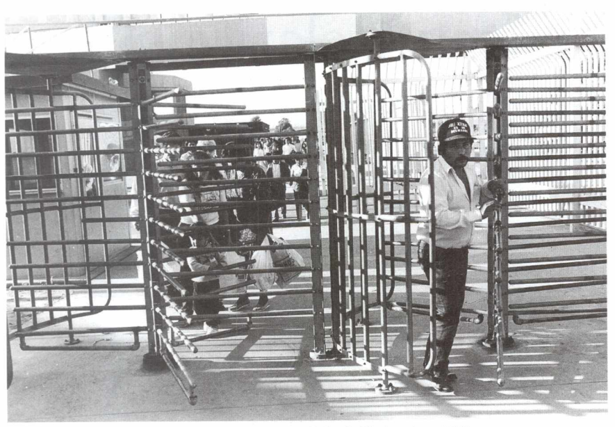
Emigration has been a systematic drain on the population in Mexico since 1960.

Ministry of the Interior, as well as the National Autonomous University of Mexico, represented by the author of this article. For the U.S., the coordinator was the Commission for Immigration Reform, created in 1990 by the U.S. Congress, with a mandate until the end of 1997. The 20 researchers (10 from each country) who did the study work in different disciplines and academic institutions all over Mexico and the United States. A plural representation of points of view and thorough familiarity with the topic was consciously sought when picking the researchers to ensure that migration would be broadly and profoundly examined without any one focus dominating.