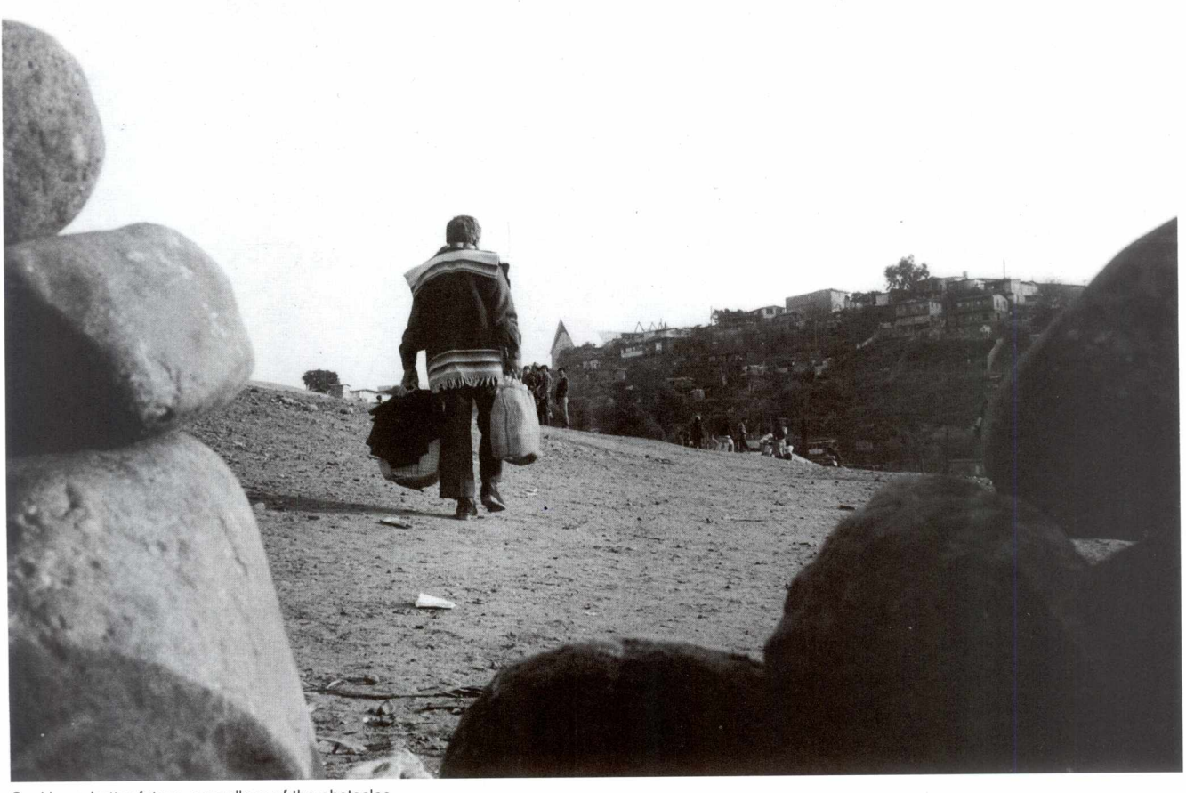
Seeking a better future, regardless of the obstacles.

next decade, the changes in Mexican demographics —which will mean a lower number of individuals in the age group that tends to migrate— and other structural changes in both Mexico and the United States —like the creation of more jobs due to the growth of the Mexican economy and a greater supply of low skilled U.S. workers due to their exclusion from social assistance programs— could begin to decrease both migratory pressure and opportunities.