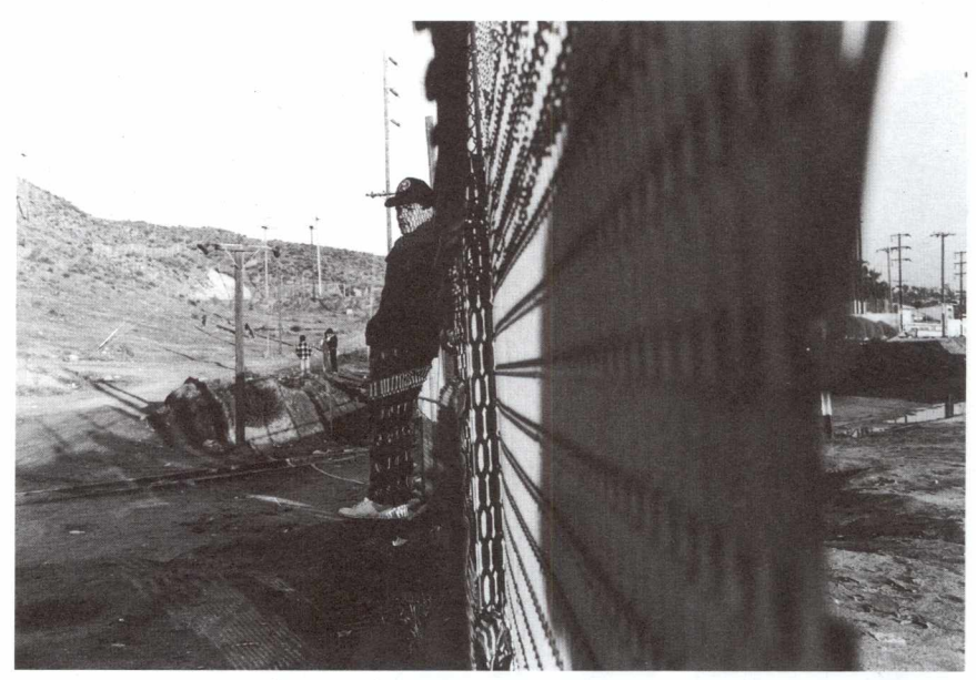
The violation of unauthorized migrants' human rights is a constant source of bilateral tension.

6. Data from Mexican censuses and indirect means of measurement show that emigration has been a systematic drain on the population in Mexico since 1960. The net emigration from Mexico from 1990 to 1996 was approximately 1.9 million people, or about 315,000 per year. Of these, approximately 510,000 are authorized migrants; 210,000 are relatives of migrants given legal status by the 1986 law; 550,000 are migrants given legal status by the Special Agricultural Workers Program; and 630,000 are unauthorized migrants.