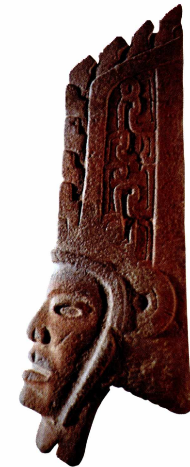
Ax from El Tajin used in the ball game (basalt), Xalapa Anthropology Museum, Xalapa, Veracruz.

The synthesis of the primordial concept, as the last and most evident symbol, is movement, ollin , ulli , the movement of the ball, the movement that emerges in the unity of opposites on the playing