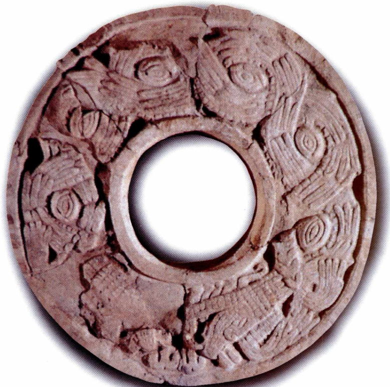
Marker for the Mayan ball game. Chichén Itzá Site Museum, INAH, Yucatán.