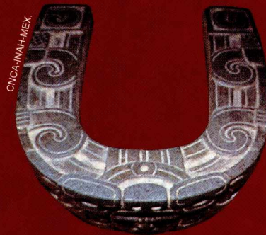
Yoke from Veracruz (green stone), National Museum of Anthropology, INAH, Mexico City.