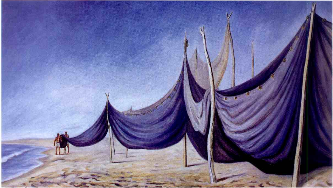
Fishing Nets , 101 x 179 cm, 1956 (oil on canvas).

as a permanent homage to Mexican women, always present in his craft.