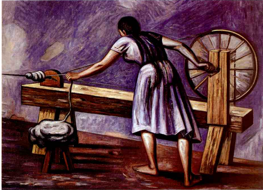
The Spinner , 145 x 205 cm, 1958 (oil on canvas).

This artist's work, through a lifetime of training, constancy and an intimate relationship with his times and his people, shows a major commitment to social questions as well as a formidable command of sketching and color. Anguiano is one of the most genuine representatives of Mexican painting in the grand tradition, a current that, despite the changes in fashion over the years, has not painted itself out and whose influence continues in the expression of other pictorial movements.