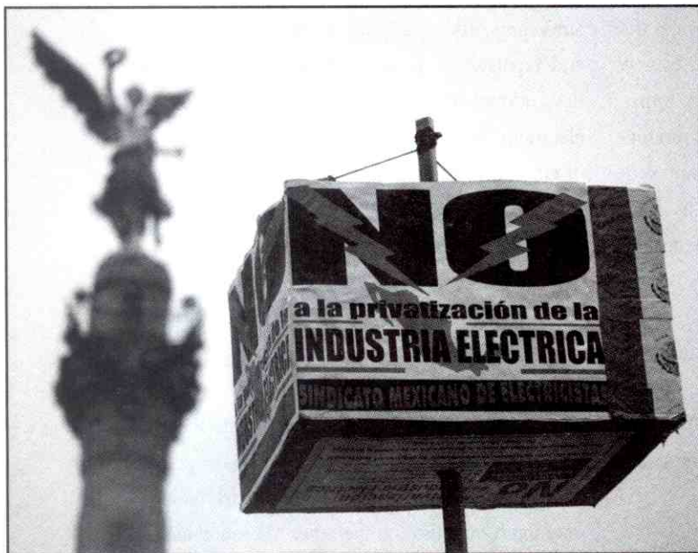
The Mexican Electrical Workers Union (SME) heads significant opposition to the measure.

on the matter, the Confederation of Mexican Workers (CTM) all favor the reform proposals and the government's reasons for making these constitutional changes. Of course, they do have slightly different arguments to support the measures, but they all agree that energy supply must be guaranteed and are optimistic about the bill getting through Congress this year.