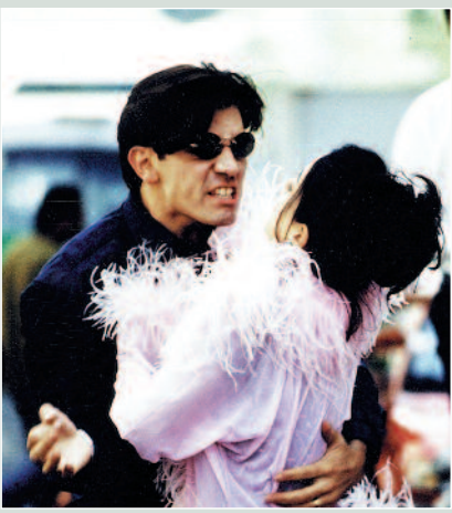
Sex, Shame and Tears , a testimony to how Mexico's generation X understands love.