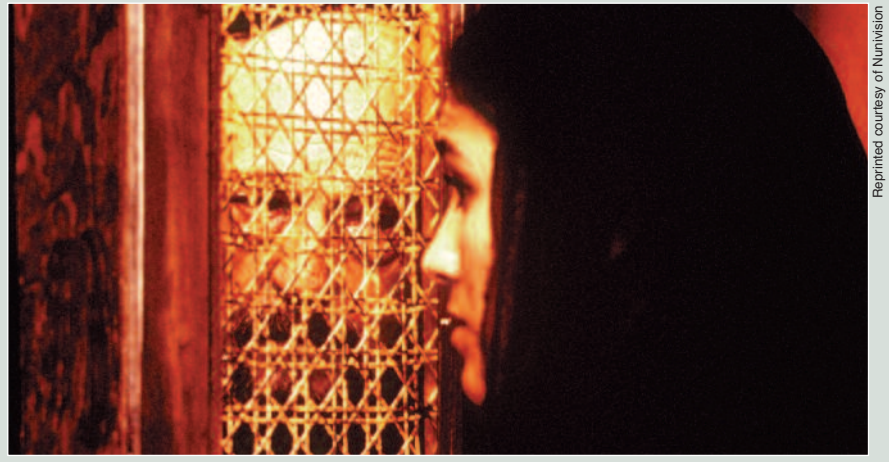
Little Saints won the Best Latin American Picture Award at the Sundance Film Festival.

and the war between women's liberation and machismo.