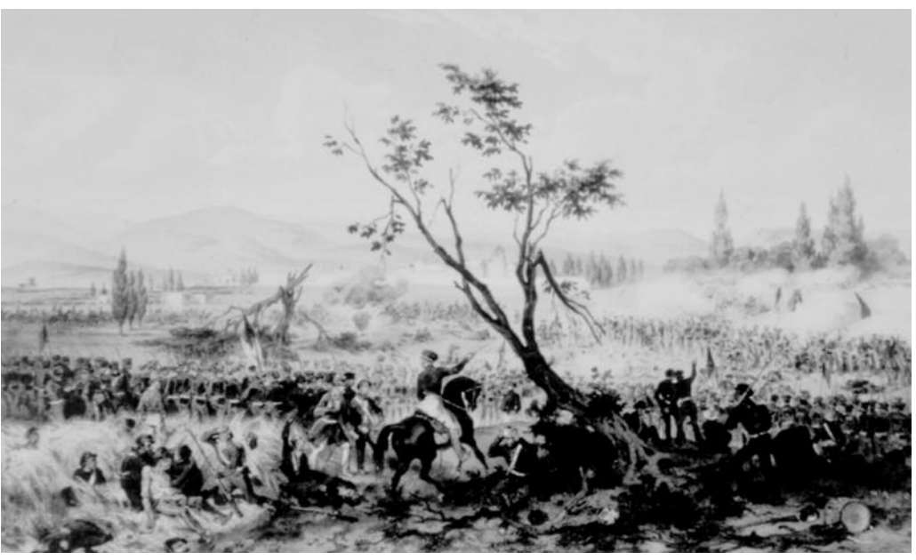
Carlos Nebel, The Battle of Churubusco, 1851 (color lithograph).

n September 12, 1997, the Mexican government paid special tribute to the soldiers of the San Patricio Battalion who were tortured and hanged at the San Jacinto Plaza, San Angel, in 1847.