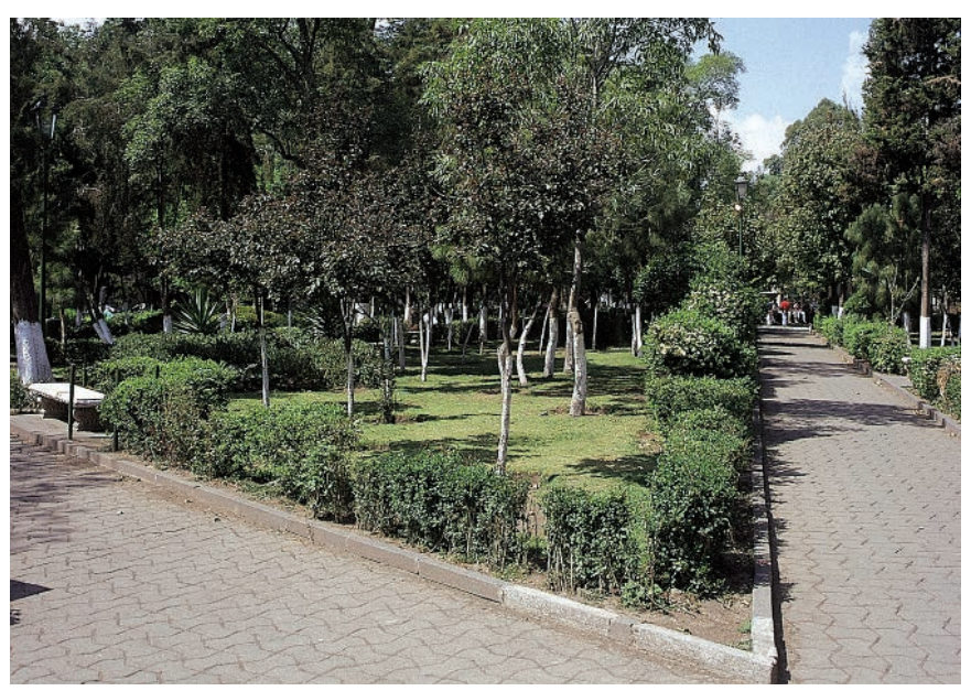
San Jacinto Plaza, one of San Angel's most traditional parks