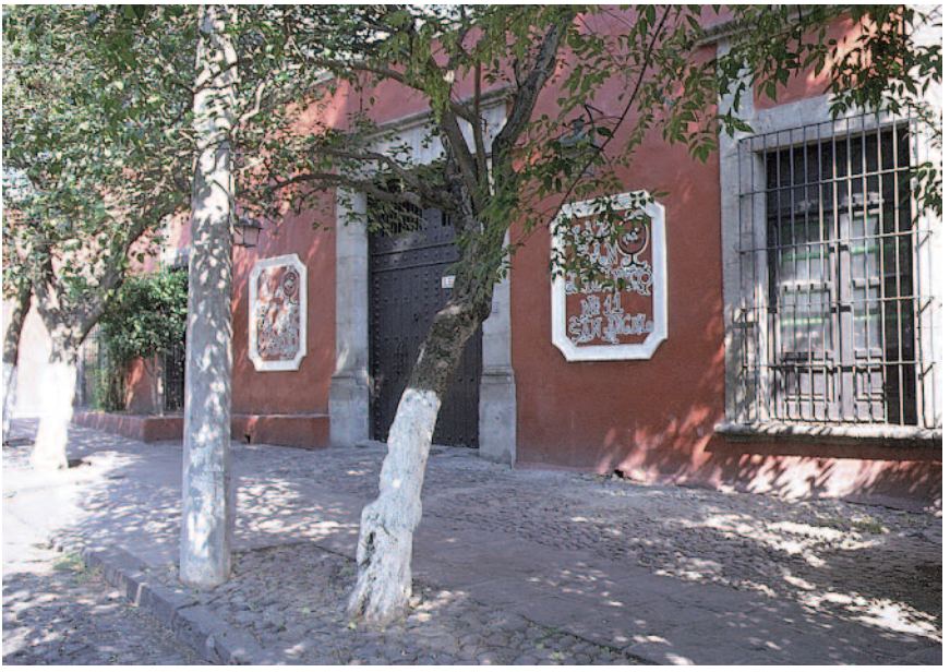
The house on San Jacinto Plaza where the weekly Saturday Bazar is held.

circumstances were to change the way of life in this once tranquil village. The first of these was the assassination of Mexican general and president, Alvaro Obregón, July 17, 1928 in La Bombilla, a very popular restaurant of the time.