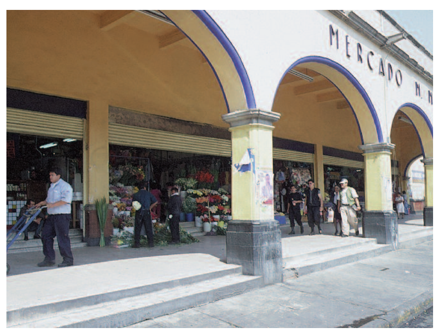
The San Angel Market, famous in the 1940s for its quality merchandise.