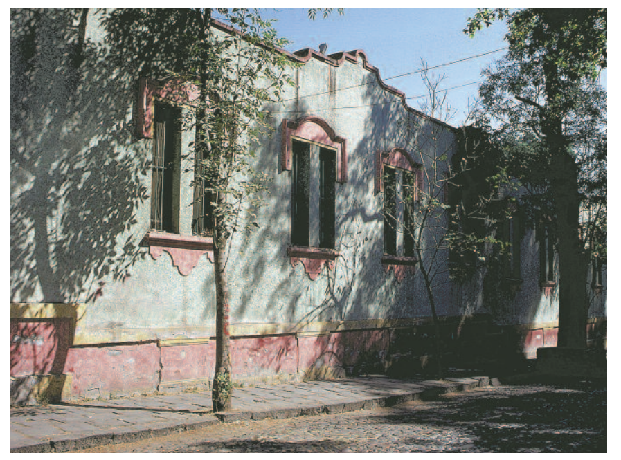
The Porfirio Parra School on the San Jacinto Plaza. The building belonged to the Silesians until the 1930s.

In order to conserve the cultural and architectural patrimony of San Angel it would be necessary to, first, delimit the "historic area" and determine that any new thoroughfares leading to other parts of the city will have to pass around this area, with the exception of Insurgentes Avenue.