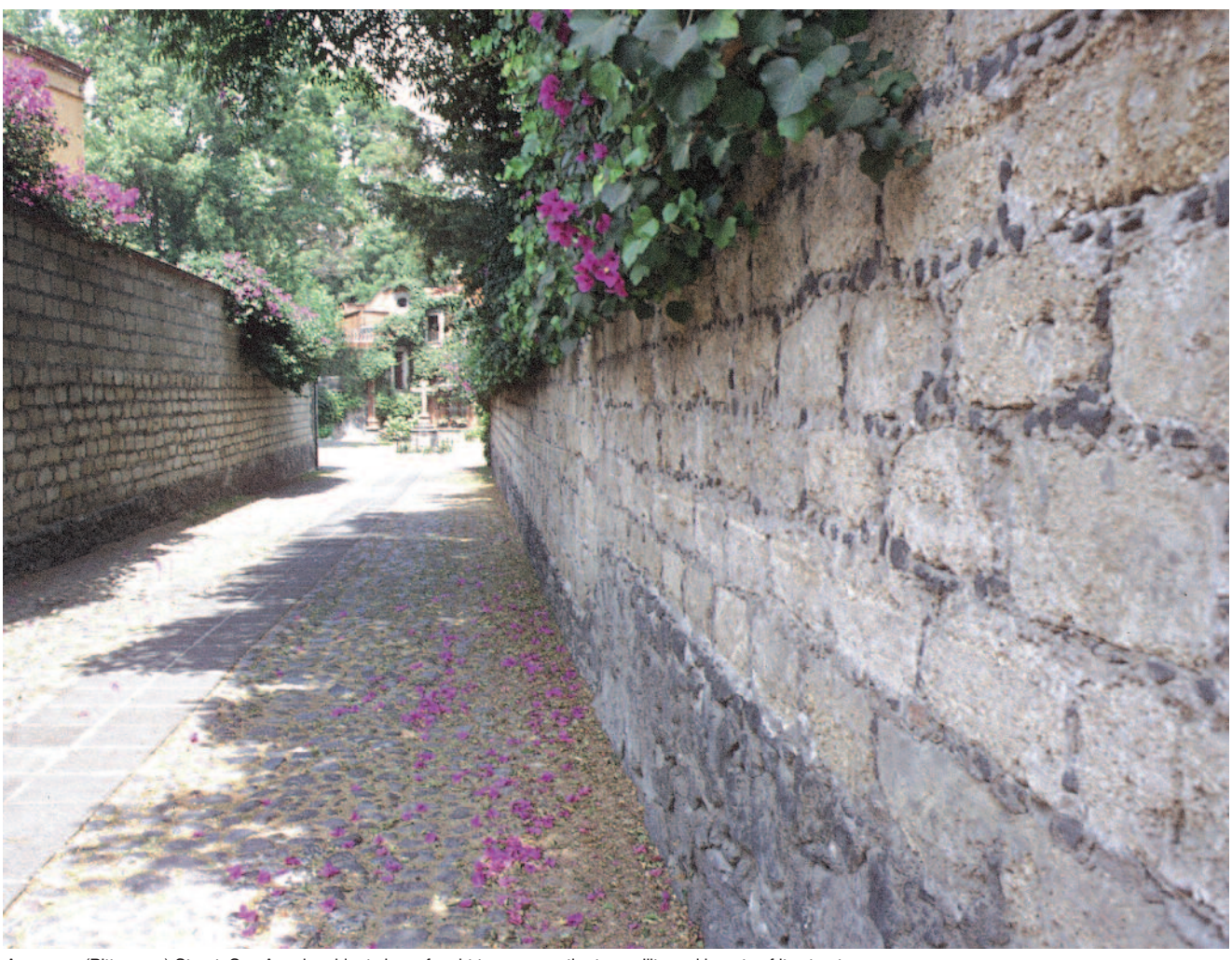
Amargura (Bitterness) Street. San Angel residents have fought to preserve the tranquility and beauty of its streets.

preserve up until then. Residents witnessed how majestic walls lining old alleyways were torn down. Small shops, haberdasheries, pulquerías, cantinas and movie theatres disappeared, stilling the voices of conversations held from one side of the street to the other between shopkeepers discussing their day-to-day successes and disappointments. These changes took place in the context of a surge in industrial activity and administrative services and amidst a tremendous increase in the city's population due to a wave of immigration. The public works were an answer to the needs of a rapidly growing population and to the decentralization of businesses and