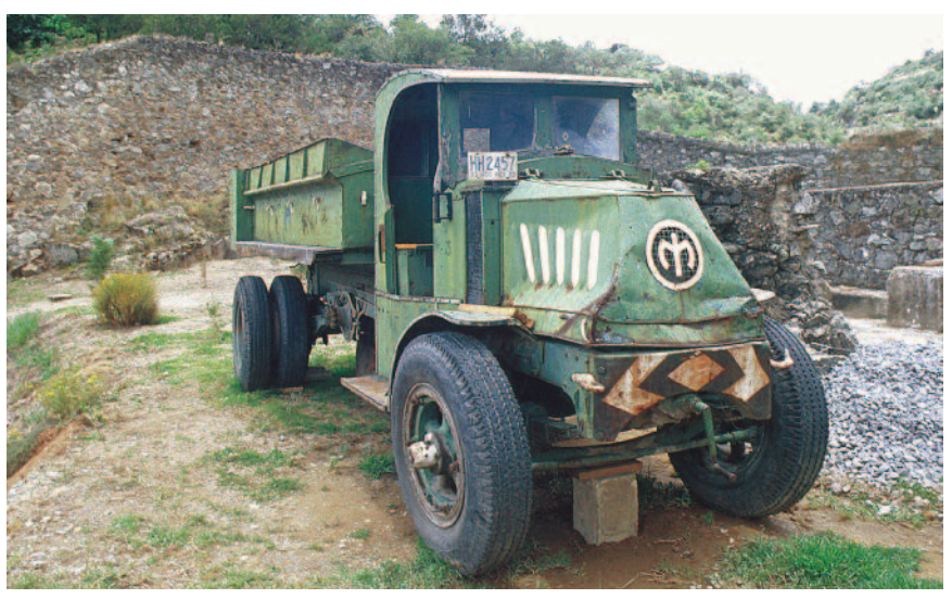
An old truck used for transporting the ore at the Acosta Mine.