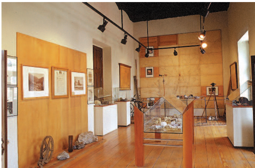
The permanent exhibition hall.