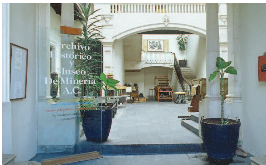
As soon as you walk in the door, you are surrounded by history.

Also, the presence of foreign engineers motivated Mexicans to train and seek places for themselves in mining; the workers also became aware of a need to study. By the end of the twentieth century, then, Pachuca and Real del Monte boasted workers who had become writers, poets, safety supervisors and empirical or practical engineers.