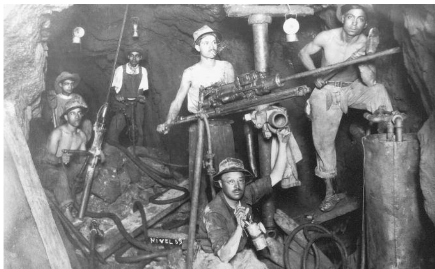
Miners with their equipment in 1927.

The Mining Museum is located in what were the old "cashiers windows," or offices, of the San Rafael Mining company, in the middle of the city's downtown area. In the past, the building had