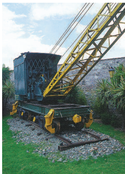
Nineteenth century steam crane.

the Loreto refining hacienda to the train station. One of the most impressive pieces is an 80-ton crane manufactured by Cleveland's Brown Hoisting Machinery Co. The crane was first steam-driven and then adapted to run on diesel and used in the Maestranza workshops until they closed in 1987. Other heavy equipment on display are the mine cars (also known as "shells" or "gondolas"); a pneumatic shovel that the miners called "the ant"; soldering plants with their own coal deposits; diamond-