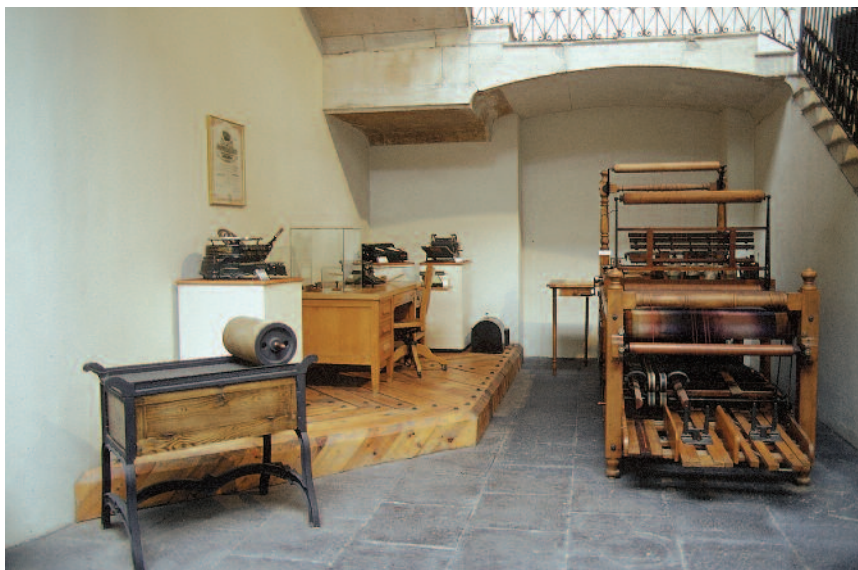
A shredder and office equipment.

The main gallery is divided into five sections: geological exploration, extracting and processing the ores, the miners' union and industrial safety. The first three deal with the technical processes involved in silver mining and the other two look at the social and labor aspects, like worker organization and owners' and employees' efforts to reduce the number of accidents in the mines.