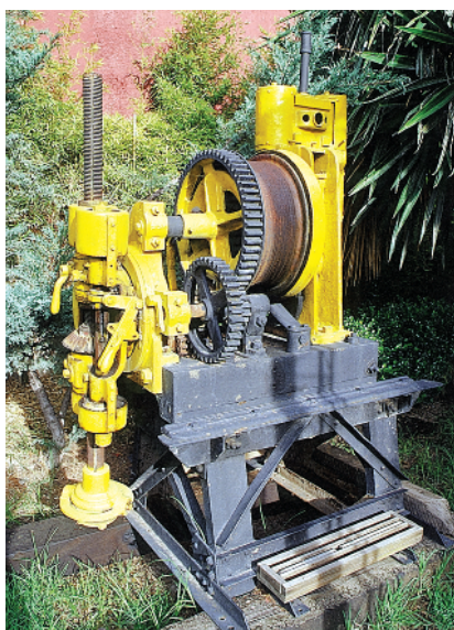
Diamond-tipped steam drill.

the Loreto refining hacienda to the train station. One of the most impressive pieces is an 80-ton crane manufactured by Cleveland's Brown Hoisting Machinery Co. The crane was first steam-driven and then adapted to run on diesel and used in the Maestranza workshops until they closed in 1987. Other heavy equipment on display are the mine cars (also known as "shells" or "gondolas"); a pneumatic shovel that the miners called "the ant"; soldering plants with their own coal deposits; diamond-