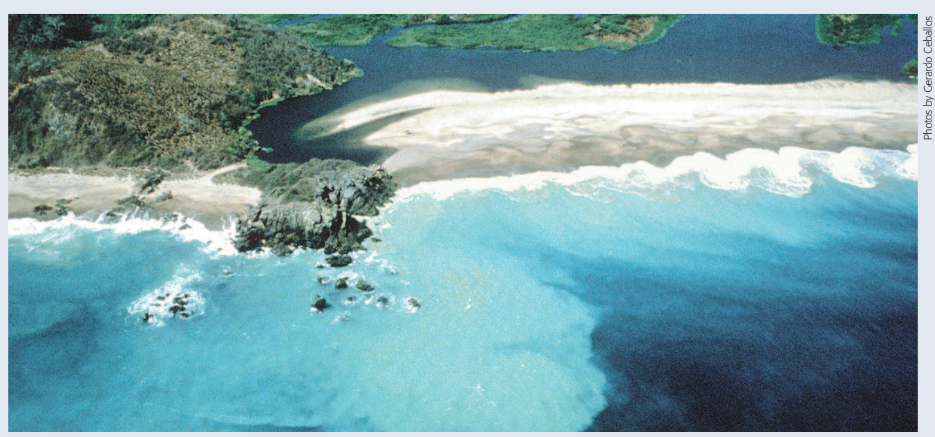
Delta of the Cuixmala River.

El llano en llamas (The Plain Afire). Up