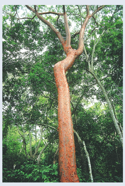
Mulato tree (Burcera simaruba).

In the spring the sounds of axes and saws invade the forest. One by one, thousands, perhaps millions of trees are felled mercilessly, pulling down orchids, vines and frogs with them, bringing down all forms of life as they fall. The piled up trees will be burned a few weeks later. The magnitude of the destruction is such that on some days the sky is black with the smoke of the fires. After several weeks of almost uninterrupted burning the smoke is extremely thick and the outline of the Sun can just barely be seen. What was a garden teeming with life will now give way to pastures and decrepit crops. Exotic grasses will replace the exuberance of the natural vegetation, and cows and goats will take the place of deer and peccaries.