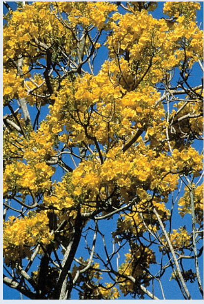
Spring tree (Tabebuia Donnell-Smithii).

ture lands. This rate of deforestation and that of the humid forests are the highest of all the ecosystems in Mexico. Year after year, the area covered by dry forests gets smaller and smaller, and, if things continue this way, the last ones will disappear in coming decades.