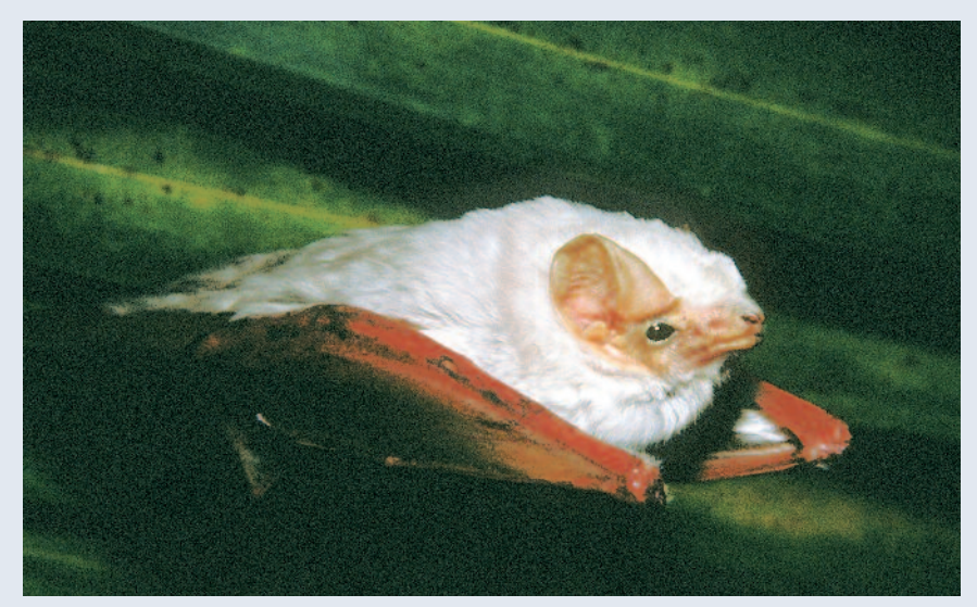
Ghost bat (Diclidurus albus).

But the abundance of water is ephemeral. At the end of November, the first leaves will fall from the trees in a dance that in a few weeks will pull them all down in a dizzying avalanche. Once again the days will be clear, cloudless. Once again the environment dries. Activity in the forest will slow considerably. Nothing will be left of the