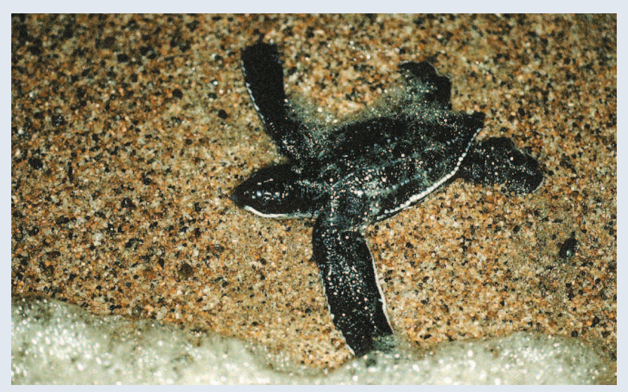
Leatherback turtle young (Dermochelys coriacea).