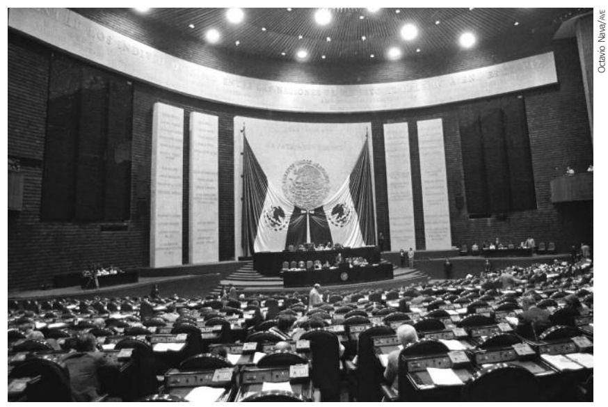
Constitutional amendments will require a PRI-PAN coalition to pass.

ore than two months after the elections, many studies have already been done about voter behavior on both federal and state levels. This election's particularities and the public's behavior at the polls will be subject to a variety of analyses that will eventually allow us to build a profile of the Mexican voter. More than contributing to that task, I want here to share a few preliminary reflections about the issues that will in all probability determine policy and the country's governability for the next three years. These issues