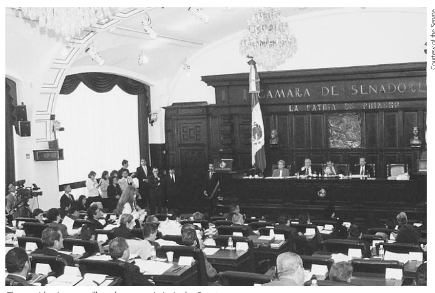
The president's party will not have a majority in the Senate.

Clearly, then, the very map of distribution of political power in Mexico complicates relations between the executive and legislative branches of gov-