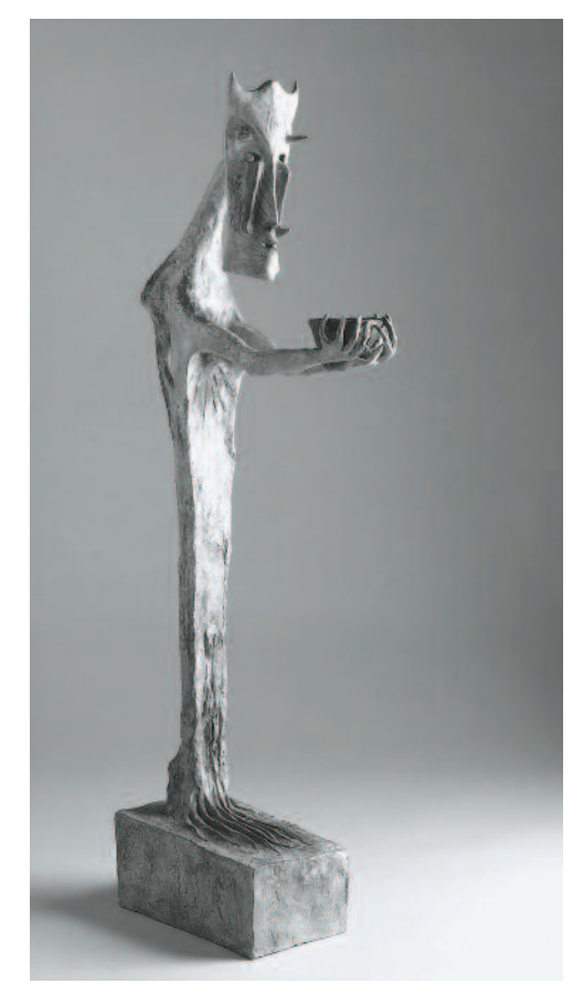
The Virgin of the Cave, 120 x 17 x 48 cm, 1995 (bronze).