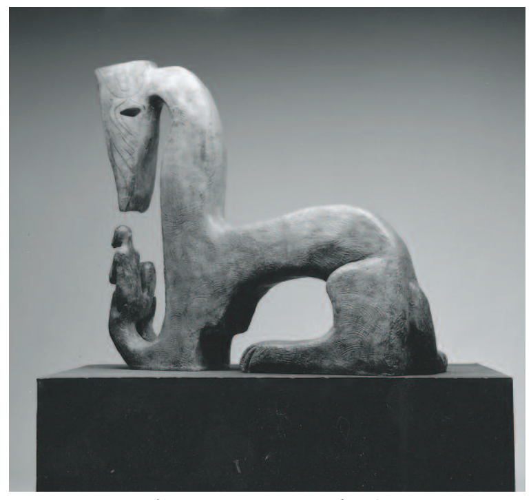
Sphinx, 95.5 x 35.5 x 106 cm, 1994 (bronze).

fountain about 30 meters in diameter in the second section of the Chapultepec Forest. Upon examination of its "impressive rigging complete with machinery and pipes, abandoned since the 1960s,"<sup>8</sup> they discovered that its hydraulic works and electrical systems had never been connected. In the conditions they found it in, the place did not comply with their needs.