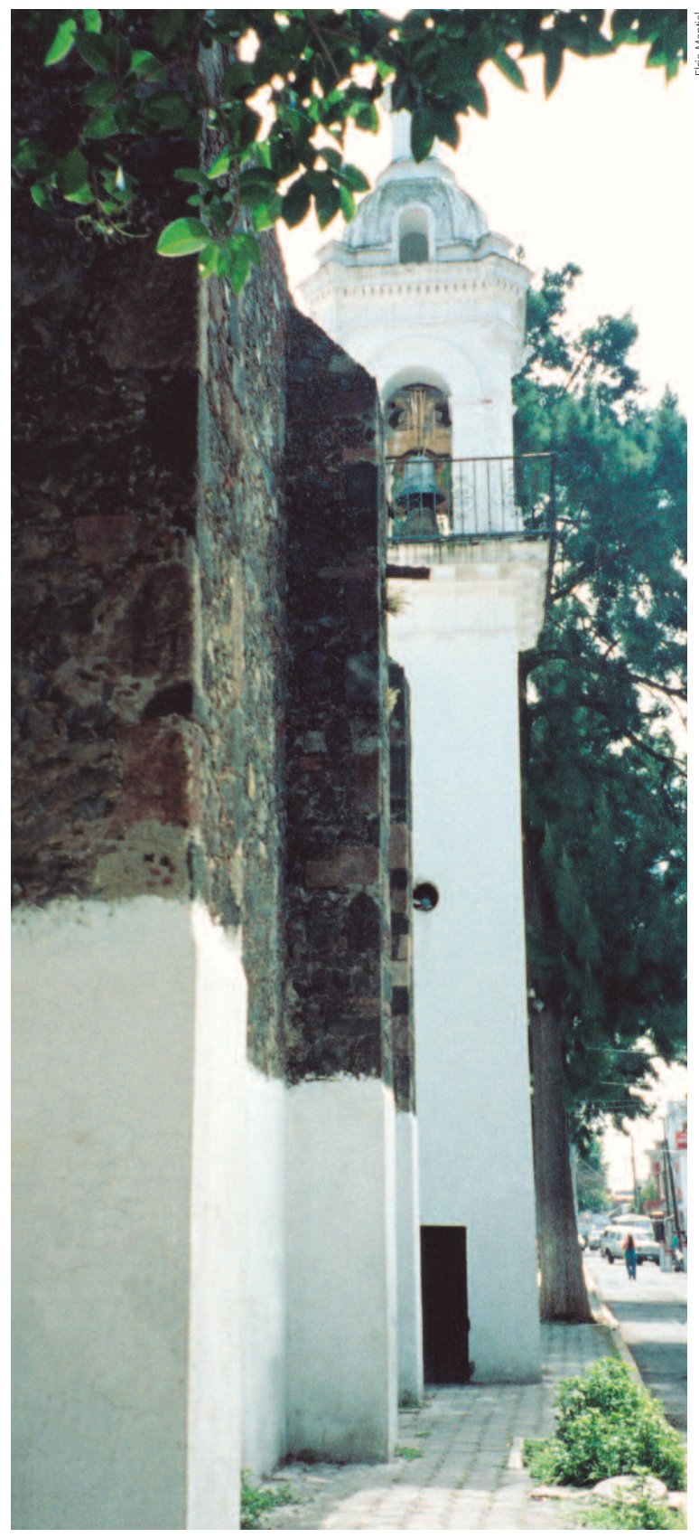
Most religious buildings in Xochimilco date from the sixteenth century but were restored later.

in the form of a Latin cross and a belfry with four antique bells. Imbedded in the walls are stone designs dating from pre-Hispanic times.