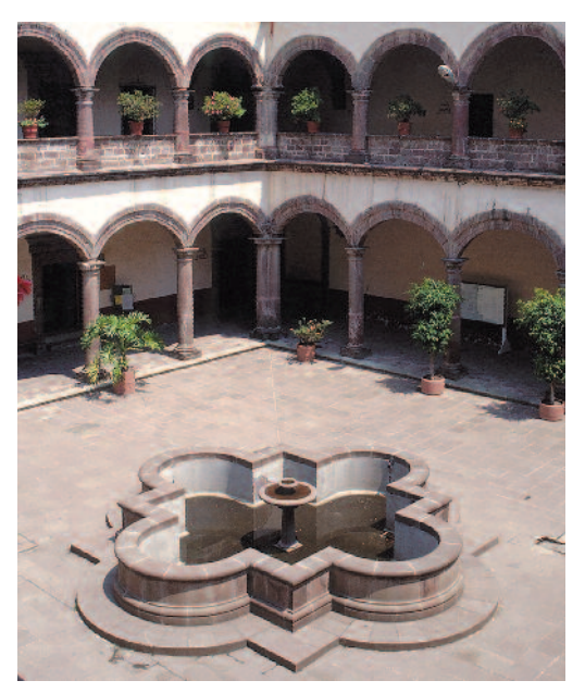
The cloister next to the Saint Bernard of Siena Church.