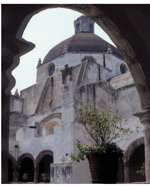
The dome of Saint Bernard of Siena church.

structures, many of which date back to the sixteenth century, outlining regular-shaped neighborhoods around the convent.