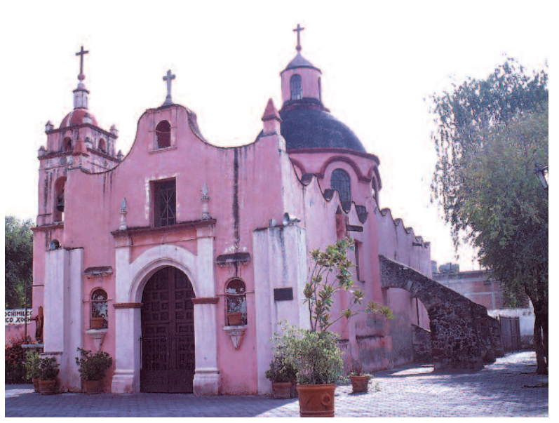
The Chapel of Saint John the Baptist Tlatenchi, located in one of the most beautiful squares of Xochimilco