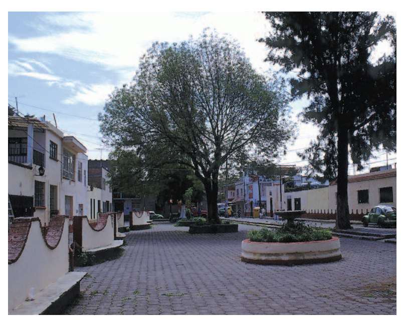
The neighborhoods were built around a chapel or central church.