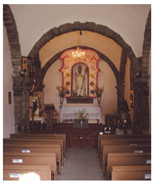
Saint Peter of Tlalnahuac was built by order of Hernán Cortés.

Xochimilco's colonial churches stand out both for their architectural beauty and because they house magnificent works of religious art.