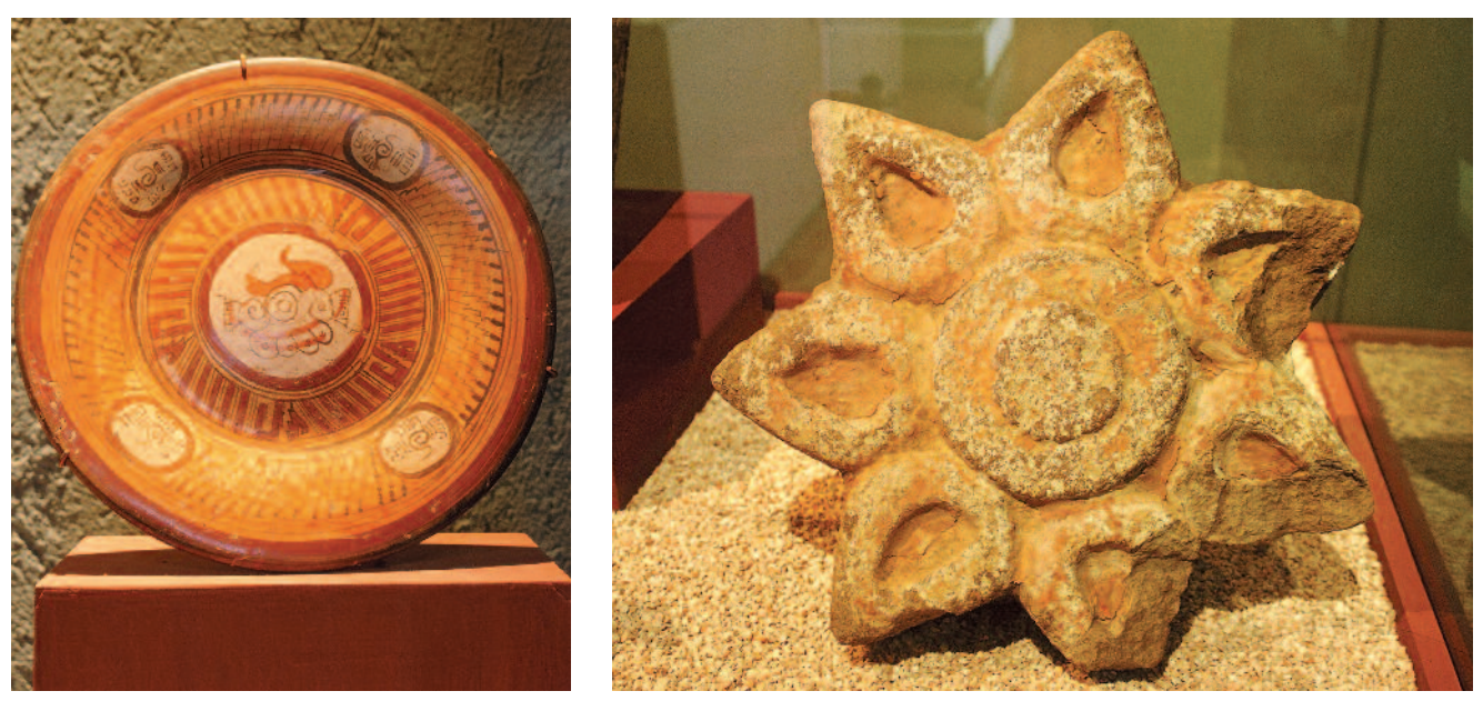
The museum collection includes pieces belonging to different pre-Hispanic periods.