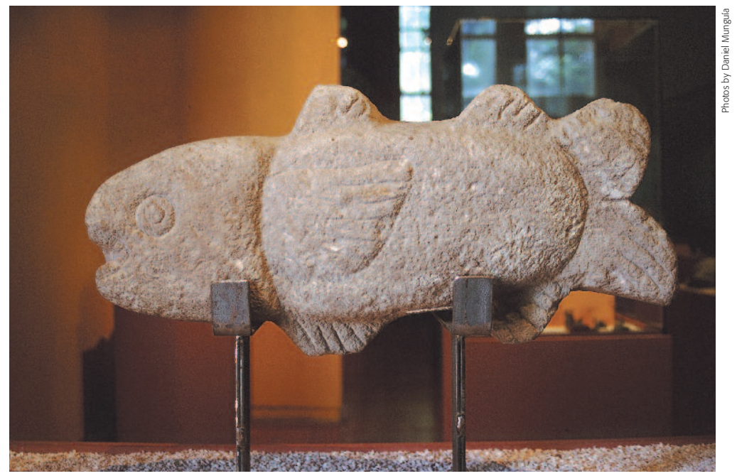
Stone figure of a long-time inhabitant of the canals.

ochimilco —that legendary town with the evocative, poetic Nahuatl name meaning "where flowers are grown," for centuries an obligatory visit in the Mexico City area— still holds surprises. One is its archaeological museum, housed in a nineteenth-century building that was originally the pump station used in the Xochimilco aqueduct.