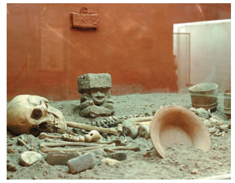
The museum's most important pieces are the Teotihuacan burial sites.

One special thing about the museum is that the visitor can go there via a trajinera that moors at the pier on the northern edge of the lavish garden surrounding the building.