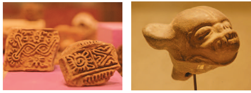
Among the most interesting pieces made of stone and clay are these seals (left) and the whistle in the shape of a dog (right).

um for exhibition. Some of the skulls in these burials show signs of intentional deformations reminiscent of the Maya. We should remember that the Teotihuacan culture stretched to the lake shores of the whole of the Valley of Mexico basin long before the Xochimilcas (one of the seven Nahuatl tribes) arrived. That is why it is not strange to find Teotihuacan remains in the Xochimilca region.