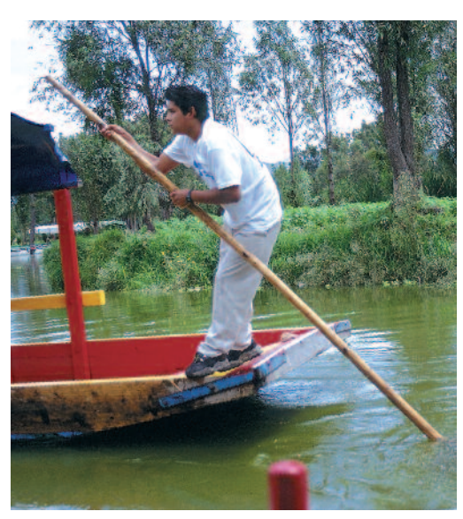
The water lily, introduced in the early twentieth century, became a blight, constantly choking up the canals.

immobility. Later I learned to know better; the contraction of their gills, their tiny legs feeling their way along the rocks, their suddenly swimming off. All this proved to me that they were able to come out of that mineral-like lethargy in which they spend hours at a time.<sup>2</sup>