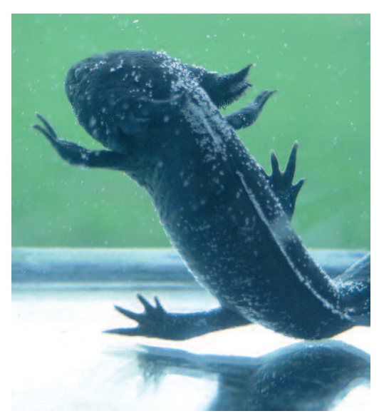
The axolotl, a legendary inhabitant of the canals.

The ahuejote's deep, wide roots form a mesh that keeps the chinampa in place, preventing its moving or disintegrating. It also protects crops from strong winds and hail.