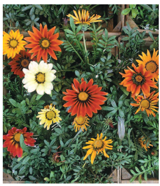
Xochimilco, an endangered paradise, has resisted more or less successfully being absorbed by the city.