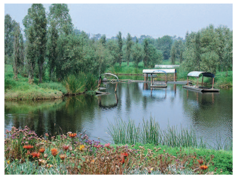
The apparent calm on the surface of the canals and lakes contrasts with the struggle for survival underneath.