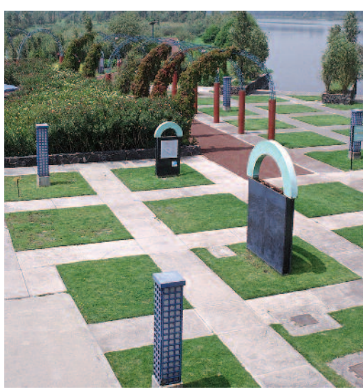
Xochimilco Ecological Park.

Here in Xochimilco also lives a kind of fresh water shrimp, the acocil , as our ancestors called it,