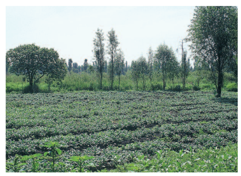
Pre-Hispanic techniques are still used in the care and maintenance of the chinampa.

Thus, the lake not only guaranteed its inhabitants the security of a good crop,<sup>3</sup> but its native fauna was also a permanent source of