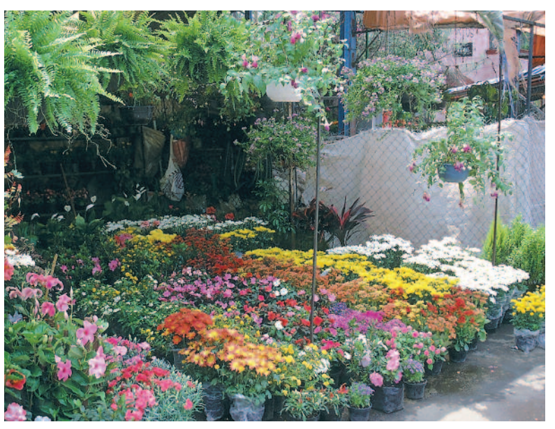
No other place in the world offers the variety of flowering plants that Xochimilco markets do.

the water lily is being waged; and an environmental educational center and a research center for local fauna have been built.