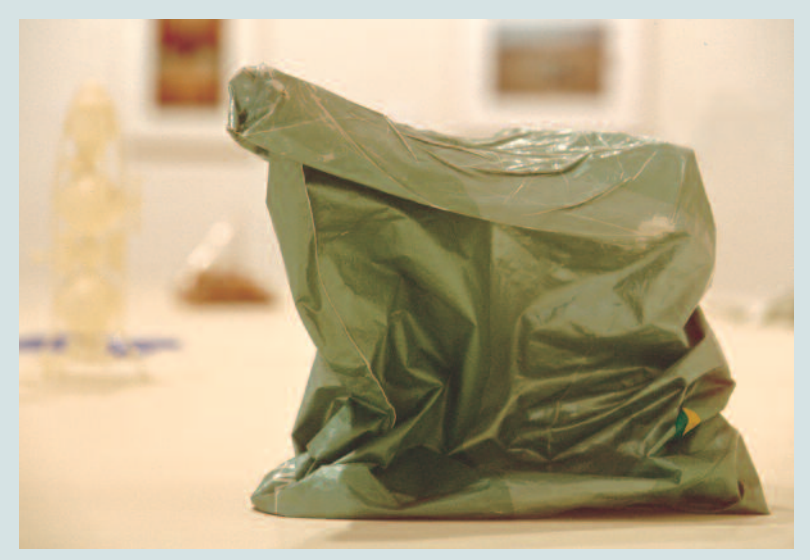
Models, detail, no date.