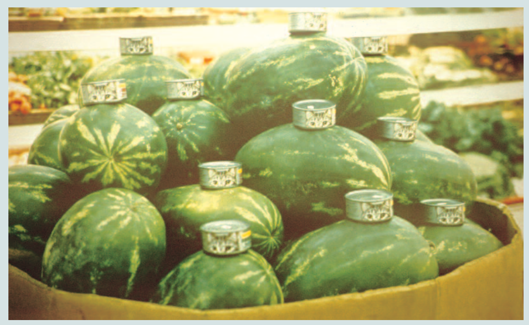
Cats and Watermelons, 1992.

"an analytical mind, an intellectual curiosity that relishes what is unassuming, novel and undiscovered."<sup>3</sup>