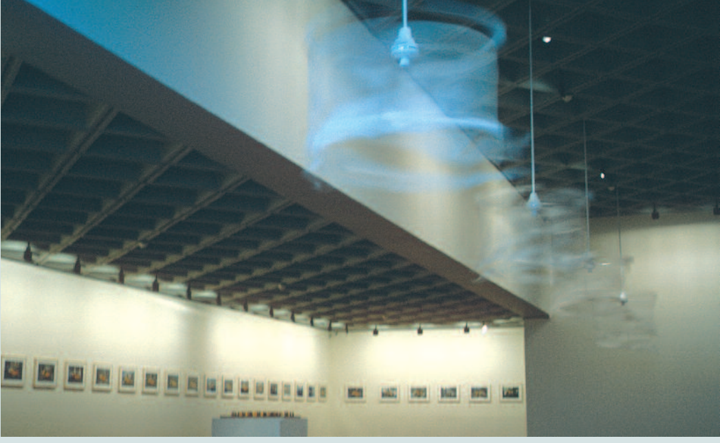
Toilet Fans, 1997.

partially due to "the fetishization of the receiver" and the tendency to idolatrize the artist as "the Latin American whose proximity with Cage's methodology and Borges' spirit may be able to dissipate the 'baroque-izing,' noisy 'bad taste' of the American Latino in the 1990s."