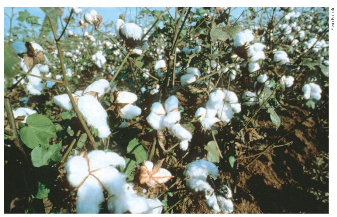
Genetically modified cotton grows well in Mexico because climatic conditions are similar to those of the U.S.

This has changed radically thanks to genetic engineering techniques that make it possible to induce new traits in plants with great precision and in a single step. By genetic engineering, we mean "the possibility of artificially creating new organisms through the combination of the genes of totally distinct species." That is, the new combinations of genes would never have occurred in nature. The procedure does not always imply inserting alien genes; it sometimes means inducing changes in the genetic structure of the plant itself. What is new about this is that a gene with the particular information desired (for example, that of the bacteria bacillus thuringiensis, which contains the code for producing an insect-fighting toxin) is located and then inserted into the organism in question.