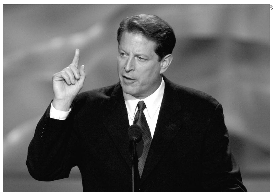
Gore distanced himself not only from Clinton's morals, but also from his achievements.

Clinton presidency's morals, but also from its achievements.