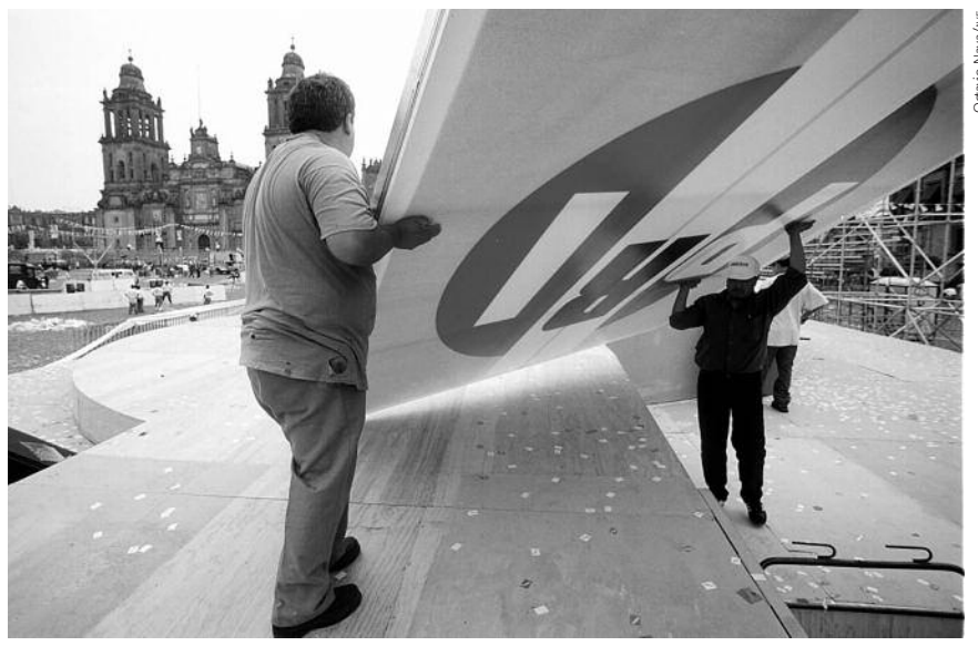
The July 2, 2000 elections opened up the possibility for a new relationship between the state and society.

bases for the country's democratic legitimacy and governability. Today, just as in the past, issues such as public insecurity ----which involves the primordial function of any state, that of protecting the life and property of its citizenshave a negative effect on the nation's public health. The same is true for the majority of crimes, which go unpunished; the corruption of public institutions, as has been shown by the recent paradigmatic cases of siphoning off of public funds from the Mexico City Treasury Department or the case of the Matamoros Customs Office, which admitted an "undocumented" elephant into the country; the inability to quash the power of the different branches of organized crime, illustrated by the spectacular escapes of drug kingpins from "high security" prisons; the persistence of large informal sectors of the economy that systematically evade taxes; and the impossibility of clearly defining the legal circumstances of organizations like the Zapatista National Liberation Army (EZLN), among others. We find ourselves facing a highly problematic