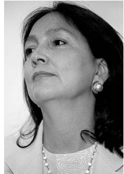
Amalia García, president of the PRD.

How can we characterize today's party system in Mexico? This is one of the central questions guiding academic thinking in Mexico about political parties. The destructuring of the hegemonic-party system has given rise to a new system that has not yet consolidated. The emergence of new parties during the 2000 presidential elections —some the result of splits in the Institutional Revolutionary Party (PRI) or the Party of the Democratic