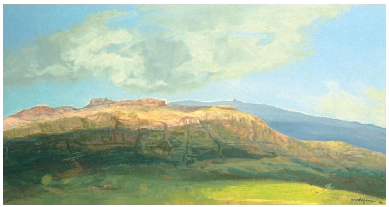
Cauldrons No. 1, 61 x 118 cm, 1995 (distemper).

ance of being excessively influenced by other painters....We think that Nishizawa is proficient enough to be able to escape these too noticeable habits."<sup>4</sup>