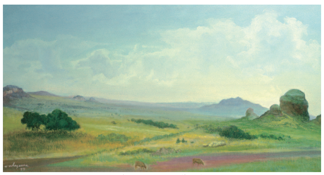
Tlayacapan, 64 x 122 cm, 1994 (distemper).