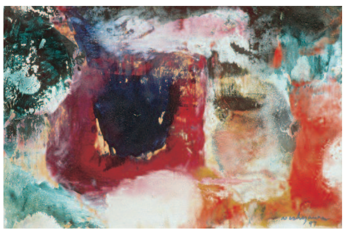
Haiku No. 8, 1997 (encaustic on wood)