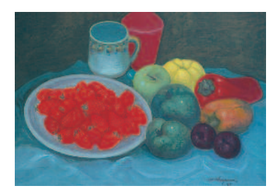
Strawberries, 62.5 x 79.6 cm, 1995 (distemper on canvas and wood).