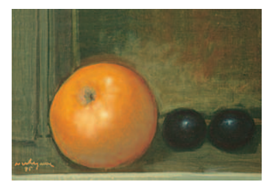
Orange, 34.8 x 44.2 cm, 1995 (distemper).