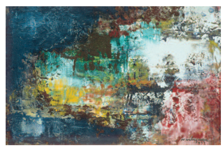
Haiku No. 4, 1997 (encaustic on wood).