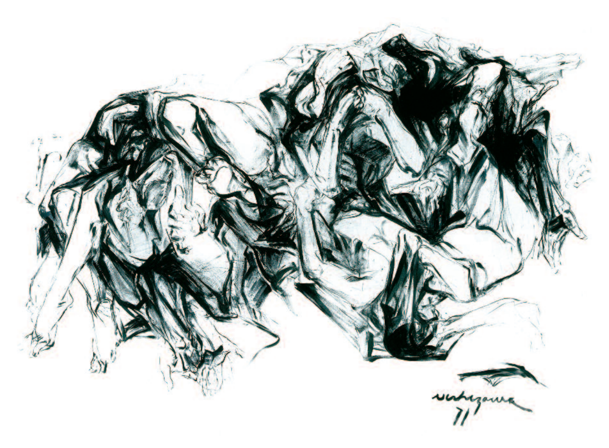
Rust, 194 x 145 cm, 1971 (sumi on paper).

content. Under that influence, they have begun to paint murals in public places.