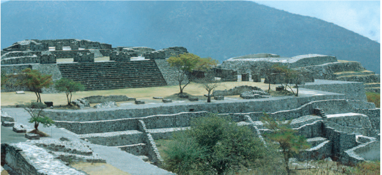
Legend has it that Quetzalcóatl was born where the vast expanse of Xochicalco's civic and religious buildings were erected.

structions and remained hidden until the twentieth century.