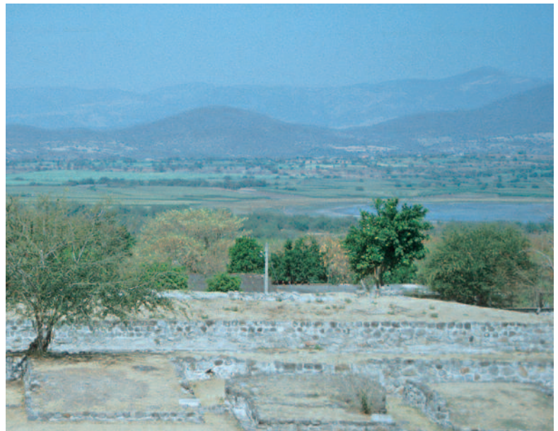
At Coatetelco, surviving ruins date from the late post-classical period.