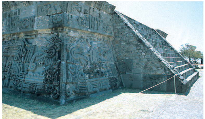
A plumed serpent winds all the way around this pyramid atop the Xochicalco ruins.

Its inhabitants settled near the springs given their water "culture." During excavation, canals built with great flag-stones to carry the water to storage deposits for use in the dry season were discovered. After the canals were no longer used to convey water, ceremonial human burials were effected in these aqueducts: the bodies, placed in lotus position, were flanked by rich offerings.