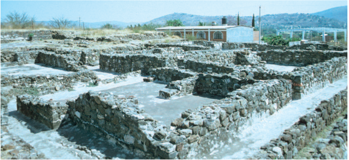
Yautepec is an excellent example of a royal palace or tecpan , originally covered with stucco and red, blue and yellow paint.

According to archaeologist Giselle Canto Aguilar, the buildings taken as a whole are arranged in such a way as to suggest a royal palace similar to the one found in Yautepec. 1 In the door-jambs of the temple's center room and on the benches with their backs to the walls, bas-reliefs have been preserved that depict geometric designs, personages, calendar dates and symbols of this people's world view, among them, the god of pulque (a fermented drink made from the sap of the maguey plant), Ometochtli. In the middle of the central bedroom, on a pedestal, was the figure of Tepoztecatl, until its presence so disquieted the Spanish friars that they removed it in the sixteenth century.