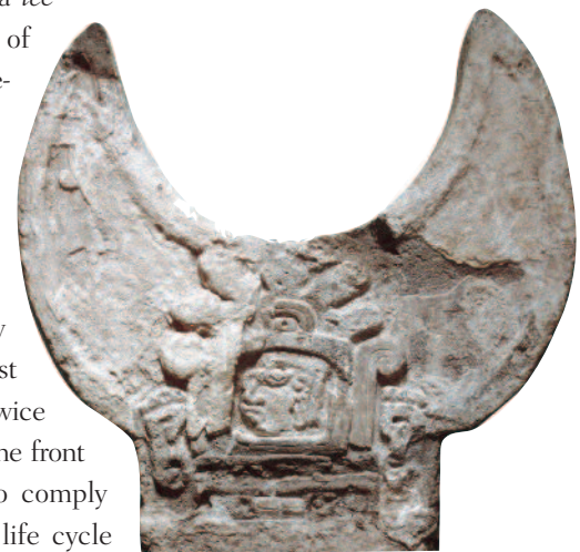
Xochicalco's Site Museum.

like Chalcatzingo. The ostentatious building, whose facade has been preserved, corresponds to the last stages of building, when Morelos was part of the Mexica empire. Originally, it was covered with stucco and painted in brilliant hues of red, blue and yellow, among other colors. As the building was being cleaned, remains of paint were found, and among the different geometric designs, archaeologists were able to identify the representation of the god of water, Tláloc. The upper part of the palace has numerous internal patios surrounded by rooms, a pattern of distribution typical of a tecpan . Around the bed-chamber of the main lord were workshops, store-rooms and service quarters. The platform on which the tecpan is built is 95 meters by 75 meters, but Yautepec as a whole in its heyday took up 200 hectares, with a population of approximately 11,500. 2 According to archaeologist Hortensia de Vega, the tecpan was twice covered by other structures, with the front facing in a different direction to comply with the Mexica belief that the life cycle ended every 52 years. 3