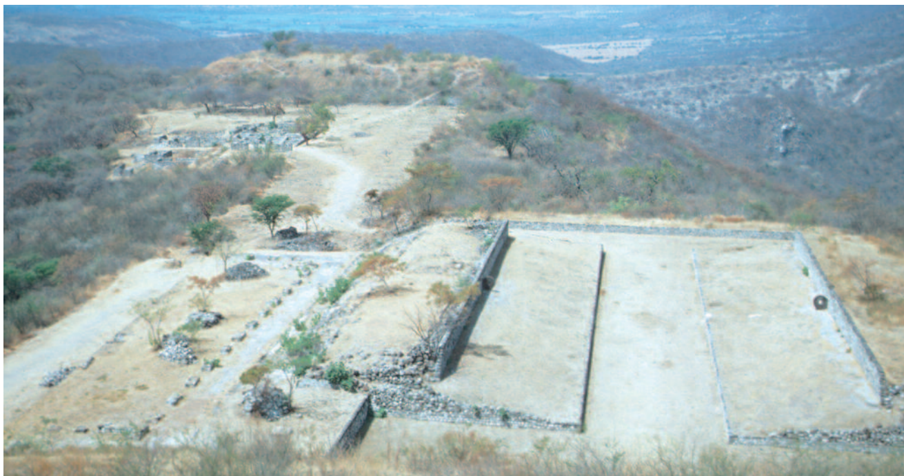
One of Xochicalco's two ball game courts.

temples on the top, such as in other structures of the same period. During the excavations, it was possible to determine that all the constructions were built in four stages.