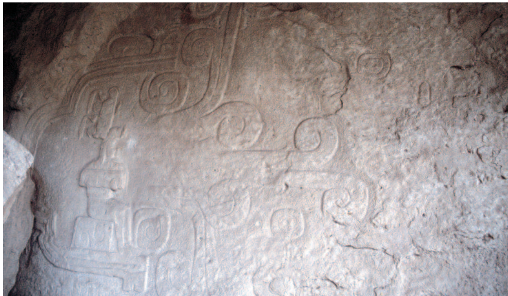
The King, Chalcatzingo.