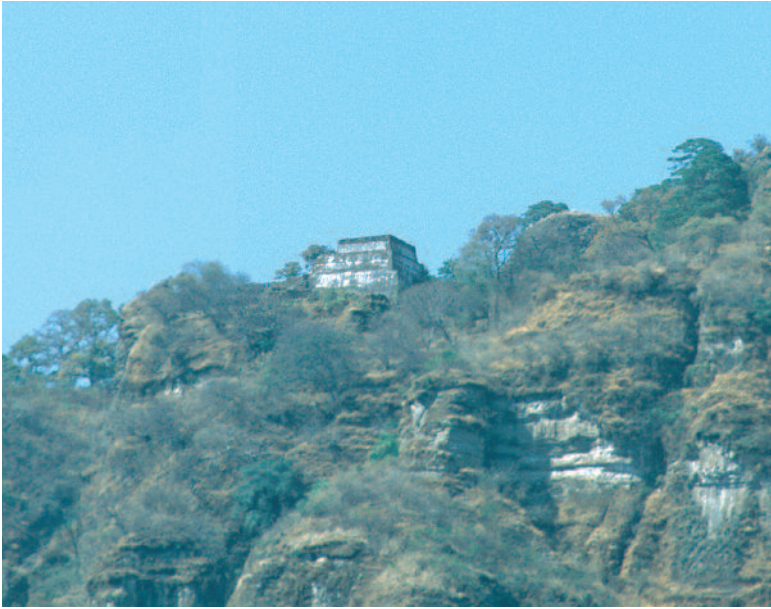
The remains of the temple to Tepoztecatl survey the entire Valley of Cuernavaca.