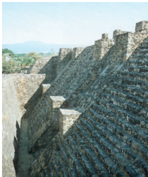
Construction of Teopanzolco took place in two stages.