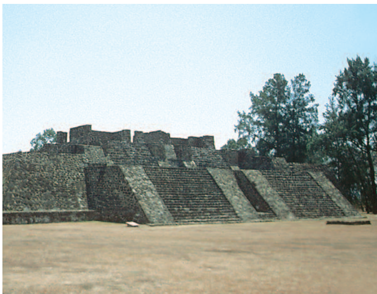
Teopanzolco may have been part of ancient Cuauhnahuac.

est is the great base of the pyramid with its double stairway leading to the temples of Tláloc (god of water) and Huitzilopochtli (god of war). The walls of the temples have been preserved; supposedly they held up a kind of wooden roof covered with hay. The walls and the stairways of the pyramid's base still show traces of the stucco that covered all the buildings. The construction clearly took place in two different stages, perhaps due to the custom of every 52 years covering the building and erecting another on top of it. In front of the pyramid base is a plaza surrounded by small platforms and other bases, on which temples dedicated to lesser gods were built. Two round bases were the foundations for the temples dedicated to the god of the wind, Ehécatl, one of Quetzacóatl's other guises. In the southern part of the site is a large platform topped with the remains of walls; archaeologists suppose it to have been living quarters. In the same area are small platforms also for living quarters, one which was found underneath the base and can be seen above ground. This room was used by craftsmen who made pigments using iron oxides that they burned in the furnaces along the walls of the house.