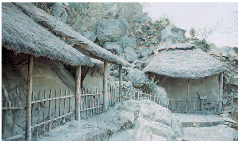
The ruins of Chalcatzingo, first inhabited around 1500 B.C., were discovered in 1934.