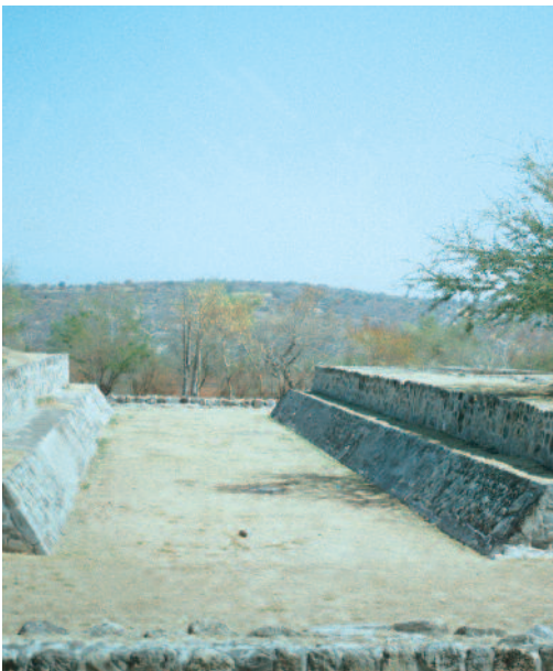
Coatetelco's ball court, one of the smallest in Mesoamerica.

Yautepec dates from the middle pre-classical period. The building whose facade has been preserved, corresponds to the stage when it was part of the Mexica empire.