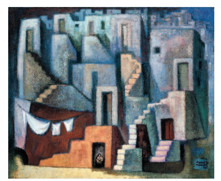
Little Stairways, 100 x 120 cm, 1973 (oil on canvas). Echeverría Zuno Family collection.

Art Gallery, and in 1945, he won the engraving competition organized by the Mexico City government to commemorate the thirty-fifth anniversary of the Mexican Revolution.