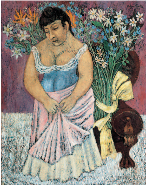
Olga Costa, The Bride, 70 x 55 cm (oil on canvas). Private collection.