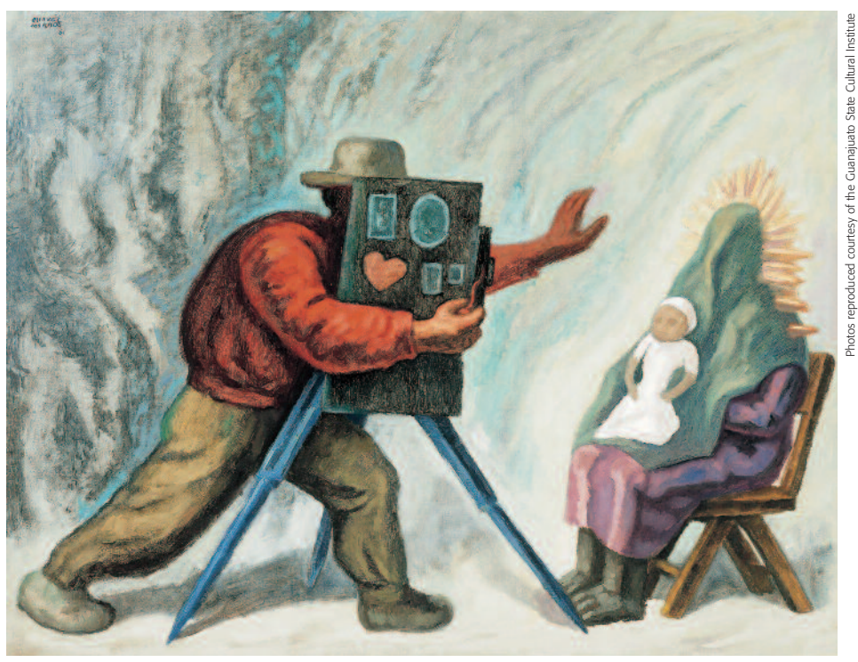
A Portrait of the Nation, 70 x 90 cm, 1961 (oil on canvas). Artist's collection.