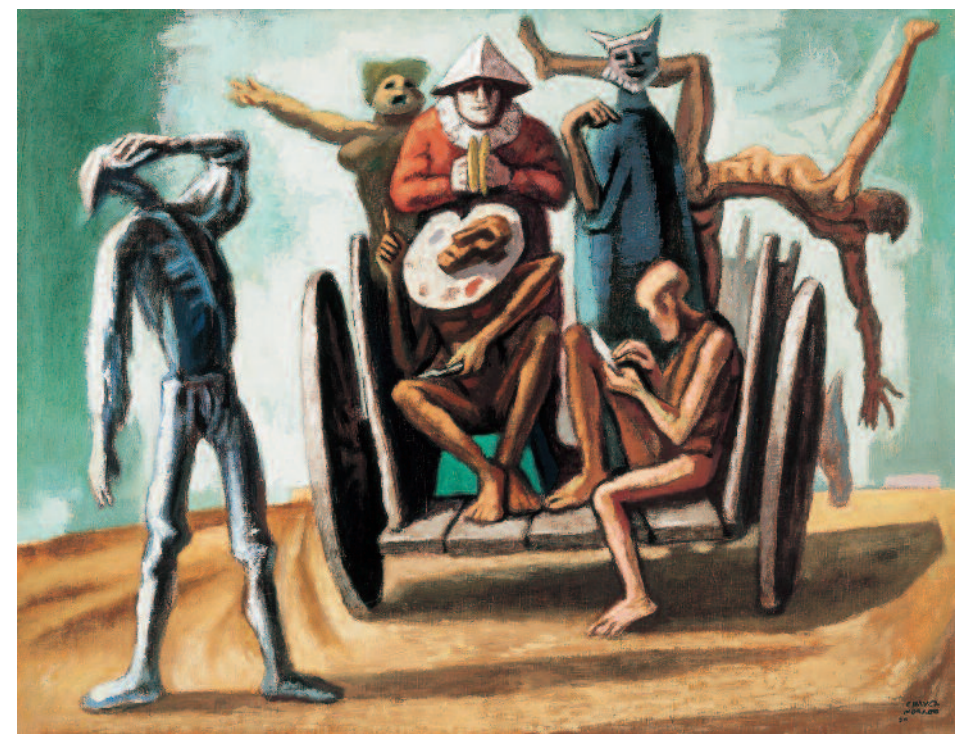
Cart of Crazies, 70 x 91 cm, 1950 (oil on canvas). Artist's collection.