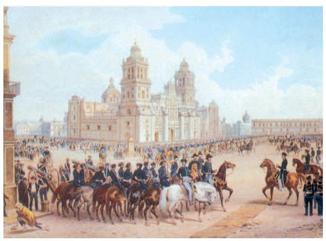
Illustration 4. General Scott's Entrance into Mexico, as reproduced in Mexico's official history books.

Among the facts not included in Nebel's illustration are the large groups of poor people who staged an uprising against U.S. troops at the Zócalo.