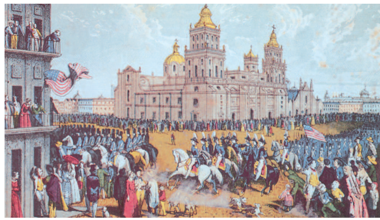
Illustration 3. The Occupation of Mexico's Capital by the U.S. Army in 1847 by P. S. Daval and Shussele (1848).

Nebel's image shows the decisive moment when General Scott conquered the capital's Zócalo. However, it also shows rejection and expectation among the Mexican population.