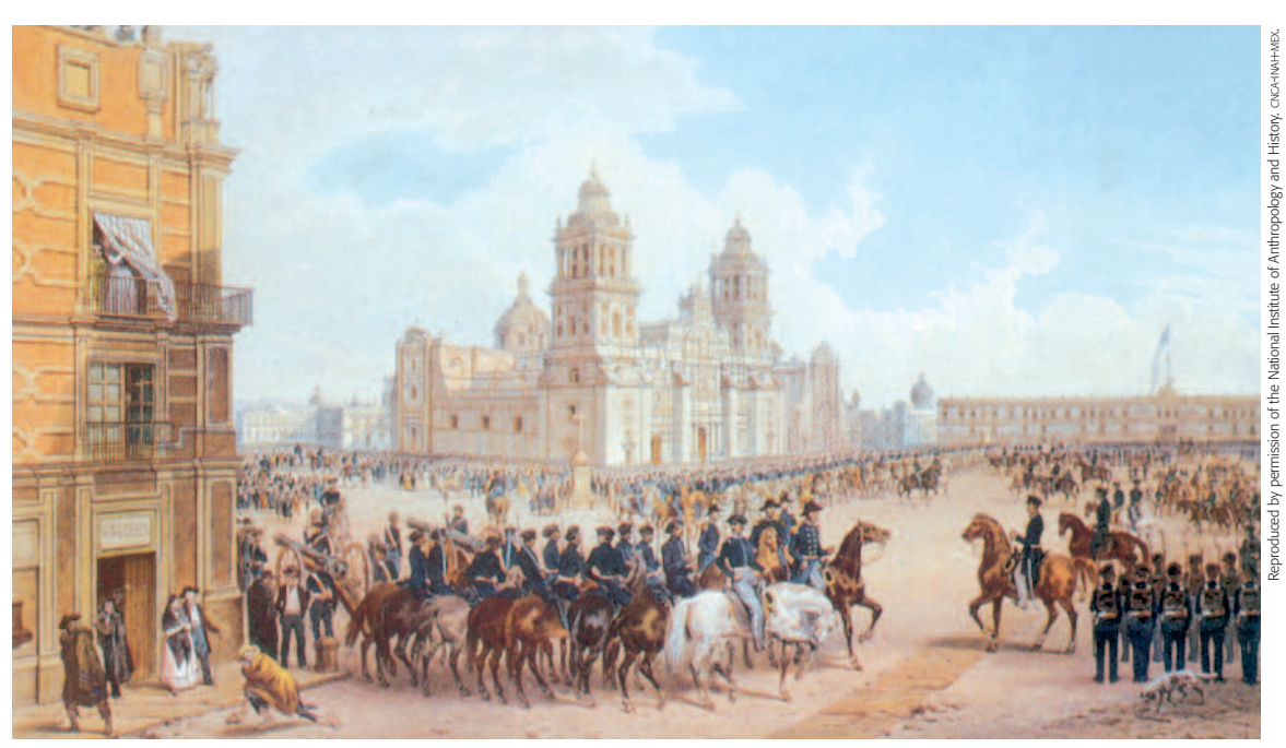
Illustration 1. Carl Nebel's General Scott s Entrance into Mexico (1851).

emory left us an image and, now, from the image springs what happened 150 years ago: Tuesday, September 14, 1847, between 7 and 9 in the morning, the U.S. army under General Winfield Scott took over Mexico's capital. This was the military and diplomatic defeat of the invaded country, the end of a stage of clashes