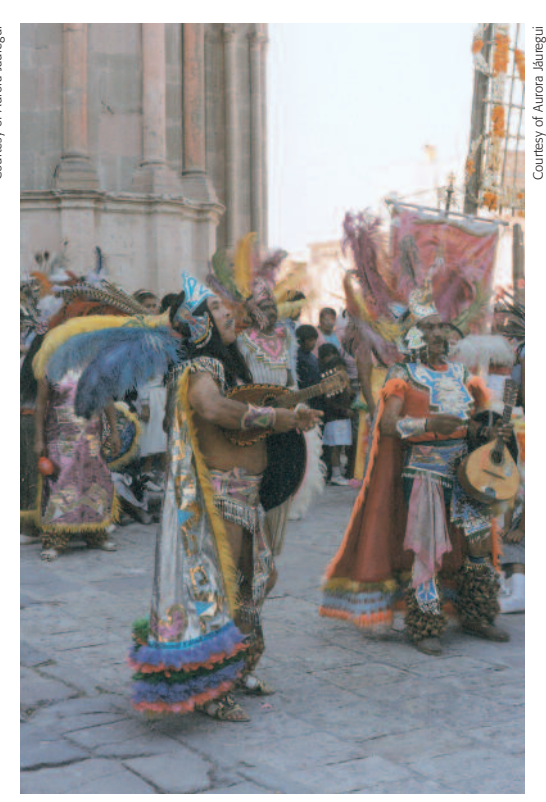
Many parts of the fiesta have changed but it survives thanks to community interest.

place after noon from the four different directions and the group from San Miguel would go out to meet them. The ritual would then become solemn for at that moment everyone present would declare that they were leaving behind their resentments and problems and were coming to an agreement, the prerequisite for continuing toward the center of the city. According to the elders, this ceremony commemorated the city's moving to its new location in the sixteenth century.