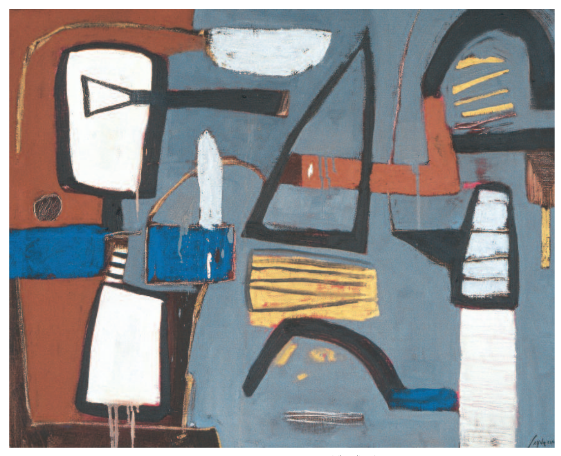
▲ Araucan Map, 80 x 100 cm, 2002 (oil on linen).