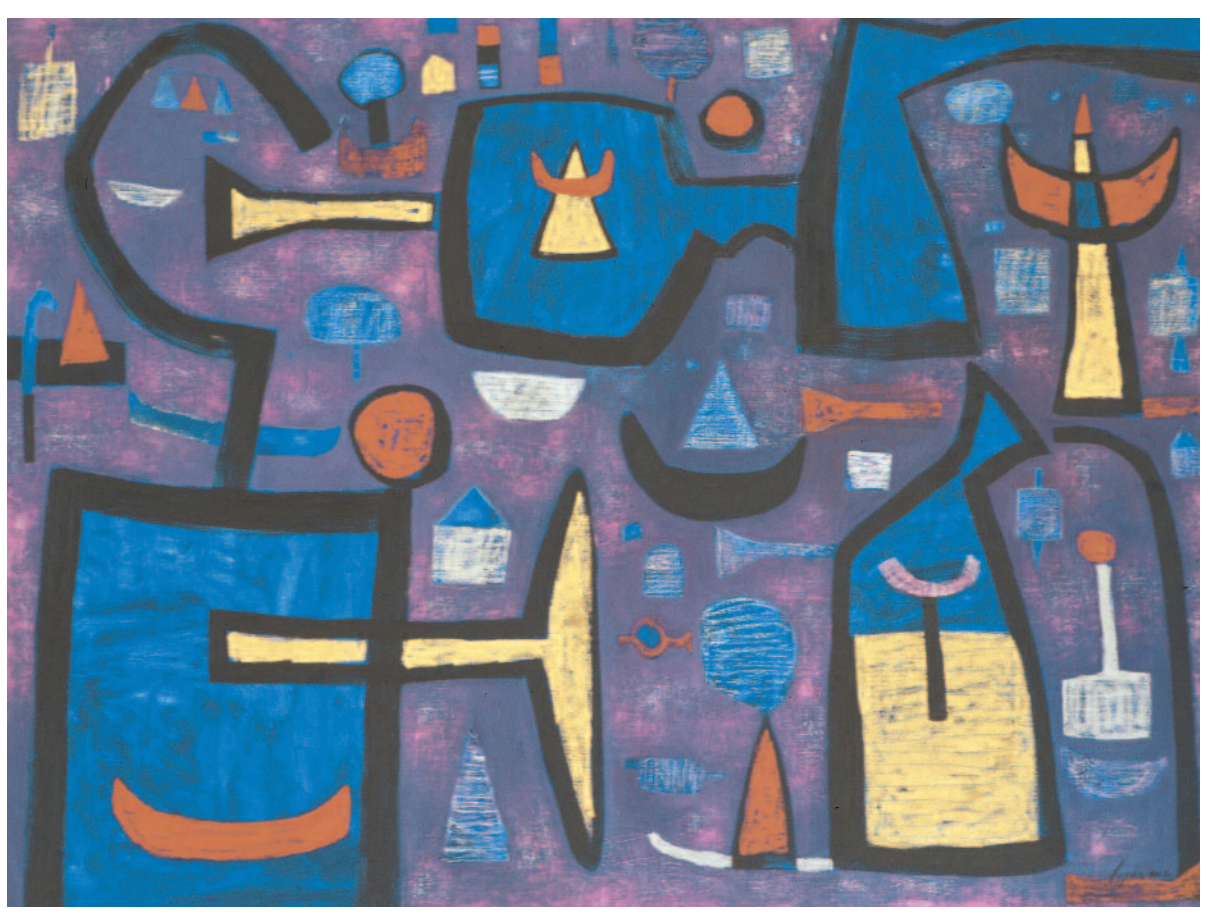
▲ The Fairies Come Out at Night, 150 x 200 cm, 2002 (oil on linen).

It should be said that, even in the past, Leyva was the artistic father of his own aesthetic genealogy; he had achieved mastery over the chain of influences that make up all personal harmony. Now he is the author who becomes his own father and personifies the quiet strength, the spontaneous confidence and the irrefutable achievement of someone who becomes a true artist and gives up residual knowledge, someone who forgets and leaves the superfluous behind to follow the only law which binds him: the law of what he does, the sovereignty of his own work. In this knowledge granted by the years only when time becomes substance and experience, integration, Leyva paints as if he were learning to paint anew and his single intention lines on the canvas are now the hand, and also the arm, and at the same time the whole body that becomes an incandescent soul and an operative God as he creates.