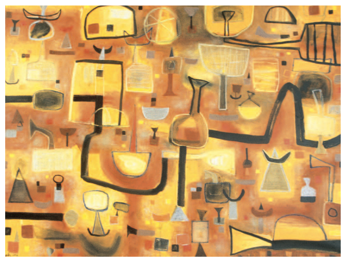
▲ The Sun's Whim, 150 x 200 cm, 2002 (oil on linen).