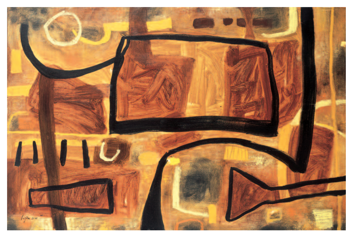
▲ The Sun's Road, 100 x 150 cm, 2001 (oil on linen).