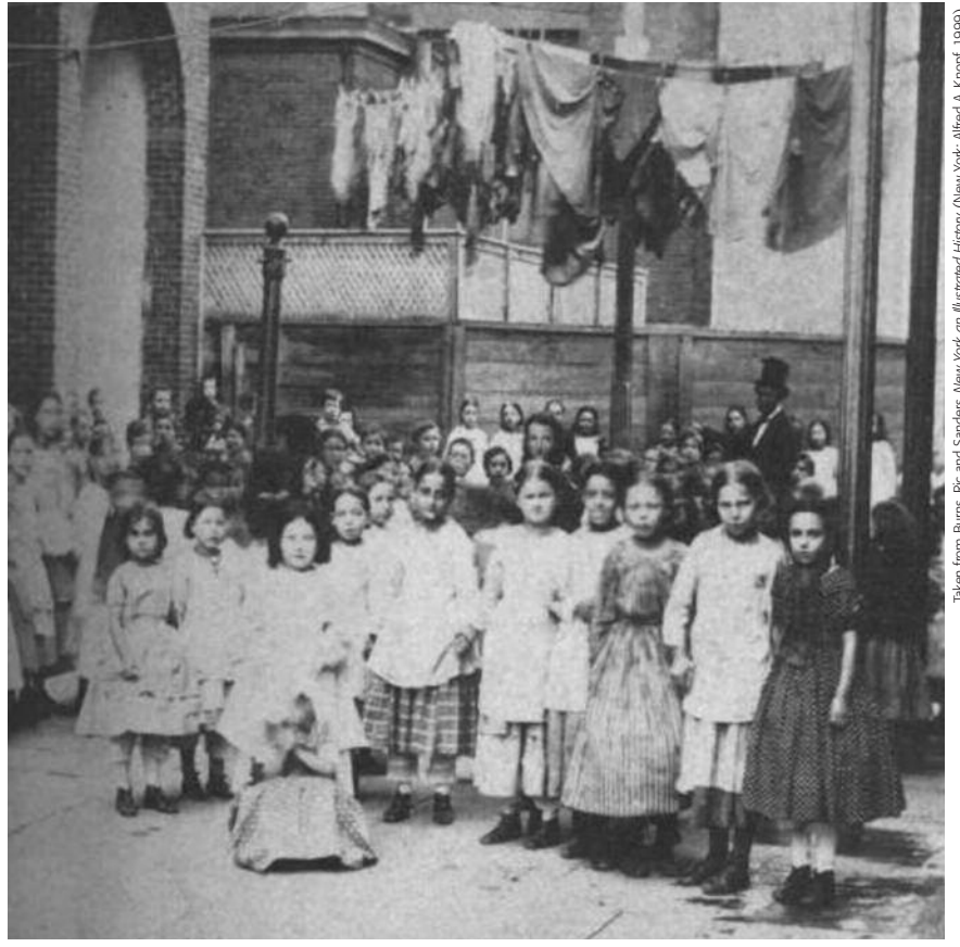
Home for the Friendless, 29th Street and Madison Ave.

During the French intervention in Mexico, several liberals went to live in New York, where they formed a group called the Mexican Club of New York.