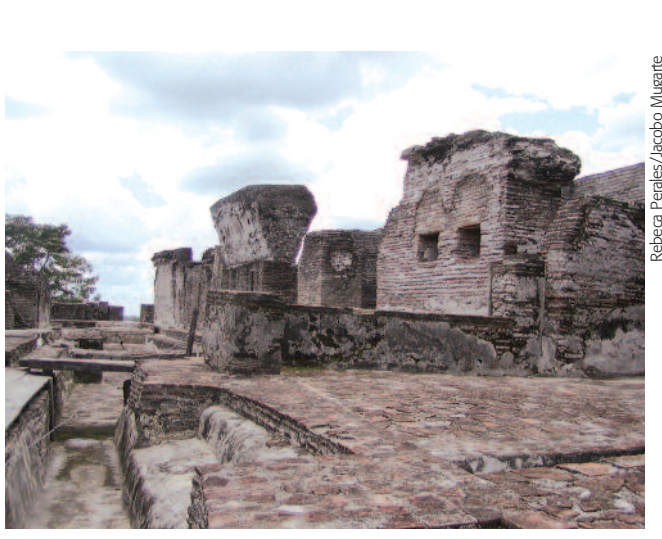
View of the palace.

Lower down, toward the Great Acropolis's northwestern edge are Temples VI and VII. Temple VI is only about 2.8 meters high, with a base