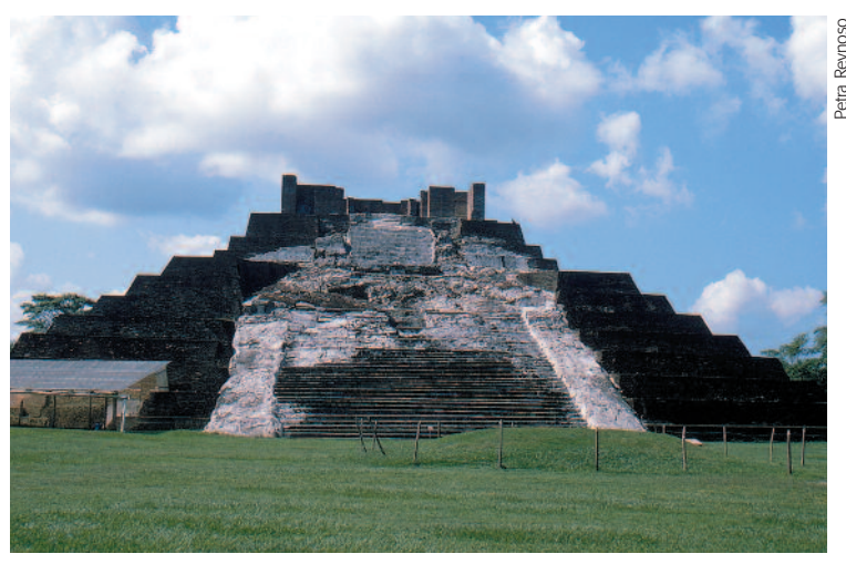
East view of Temple I.

Chontal constructions were made of brick, as a substitute for stone, unavailable in the region. The most widely known city of brick is Comalcalco.