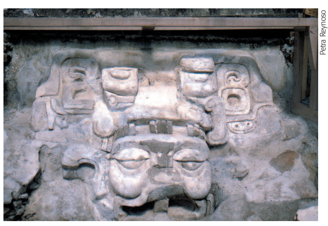
Kinich Ahau mosaic, Temple VI.

Comalcalco grew to a large size after the fourth and fifth centuries A.D. Its golden age would then last until the eighth and ninth centuries.