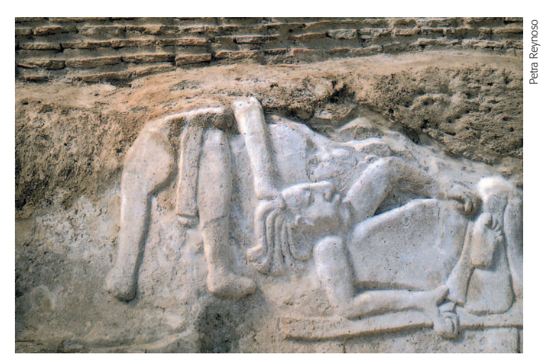
Captive, southeast corner, Temple I.

Now we know a little more about the history of that ancient city that the Chontals built with brick, covered in stucco and later abandoned.