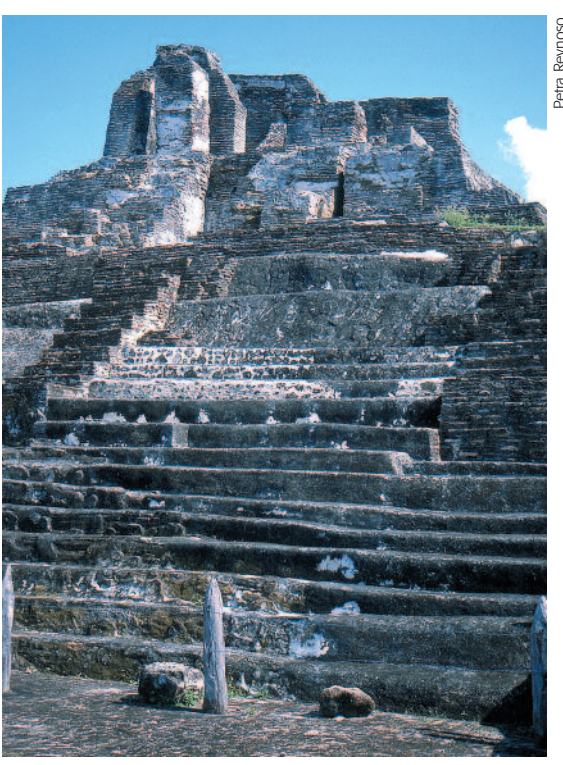
South side of the Great Acropolis.

At that time, merchants from central Veracruz visited Comalcalco and other urban centers of Tabasco's coastal plain. Later, groups of Nahuatl origin from central Mexico arrived and settled in a place the Spanish later named Provincia de Cimatanes. So, when the Spanish conquered the region in the sixteenth century, the Cimatecs, who exercised important economic influence in the entire region, had taken refuge in the abandoned city. By then, the political-economic importance