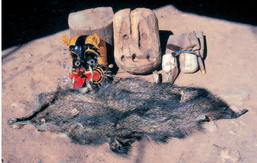
Tiger masks have become another symbol of Olinalá. Their bright colors and design remain the same.