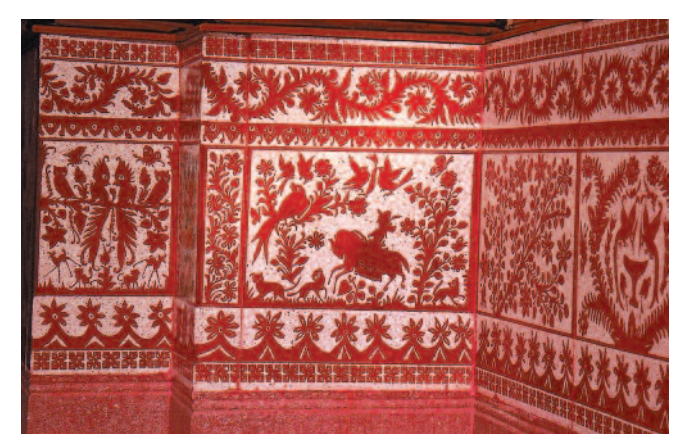
Decorations on granite at the base of the columns.

Even the main church is an unmistakable example of the beautiful art produced in Olinalá.