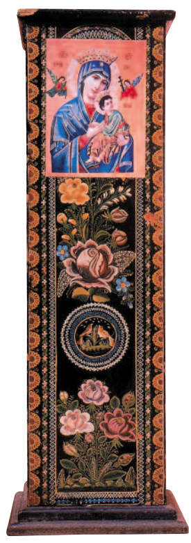
Wood piece for alms. "Gold" technique.

Today, the wooden objects are no longer made in the family carpenter shop, nor do the artisans necessarily have to go into the mountains to bring back the soil they use to prepare and decorate the boxes. People in the town now do a lively trade in both wooden objects and the earth and stains. But the preparation of the pieces, the soil and stains for their decoration and the techniques of application continue to be the same ones used by their forebears, probably even before the colonial period. And the most important thing is that all the pieces from this town have the unmistakable mark that identifies them as a product from Olinalá.