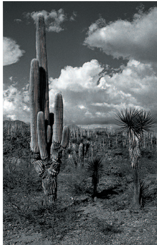
▲ Tehuacán Landscape , 2002 (analog photography, B/W negative).

This series is my first work as a photographer. With it, I discovered a universe new to me, while for others it is a well-worn path in Mexican photography. Today some photographers say they are tired of images of the Mexican countryside, and a gap seems to be opening up between those who do direct photography and those who do constructed photography. The change from analog to digital photography is advancing by leaps and bounds. It is said that documentary photography is in crisis, and there are still those who criticize digital work because it is very manipulated by computer.