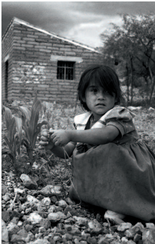
▲ From Your Field , 2002 (analog photography, B/W negative).

This complex dilemma is confusing at first, but then it motivates us because it shows that the way forward has thousands of possible routes. Documentary photography invites us to propose new ways of making documentaries, perhaps experimenting with a hybrid of direct and constructed photography so that instead of widening the distance between the two kinds of photographers, the photo, its substance, can be renewed, reborn and transformed, finding a language of this time, recreating and using all the tools: direct, constructed, analog and digital. At bottom, the important thing is that the basic questions about what we feel, think and want to say through images find their own way forward toward the answers. Those answers will only be validated by time, by people who, when they look at the images feel, share and confirm for us that snapping the shutter at that precise moment was indeed important. MM