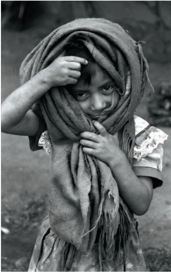
▲ Shawl Girl , 2002 (analog photography, B/W negative).

society. So, I discovered a rural Mexico that nobody tells us about, even if we know that it's there, abandoned and transforming itself by leaps and bounds. Above all, poor, with production that barely supports a family; marked by marginalization, spurring migration to the cities and the other side of the border, to the United States. It's a countryside that cannot find its place in this fast-moving world, which may have left it behind, even though it feeds that world, which cannot live without it.