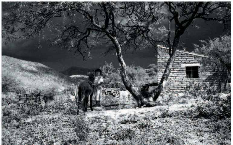
▲ Before the Rain , 2001 (analog photography, B/W negative).

However, in this country, landscapes are rarely uninhabited; nature is not an isolated element; rather, it exists in communion with