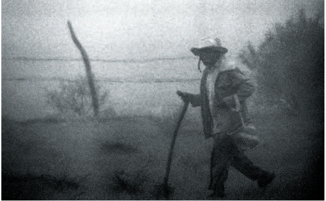
▲ The Step of a Dream , 2002 (analog photography, B/W negative).