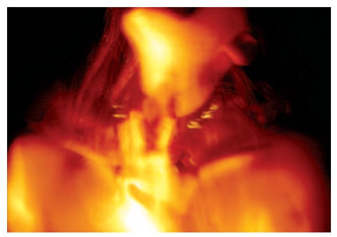
▲ Release, 2004 (painted with light and digital manipulation).

In my opinion, only those who have experienced this illness at some time in their lives can describe what depression means. Over time, it has been described by different people as a kind of limbo: Winston Churchill called it "the black dog"; others have called it "the black tunnel", "the dungeon" or "the thick fog." For me it was like getting close to what could be hell, where the only palpable hope is death.