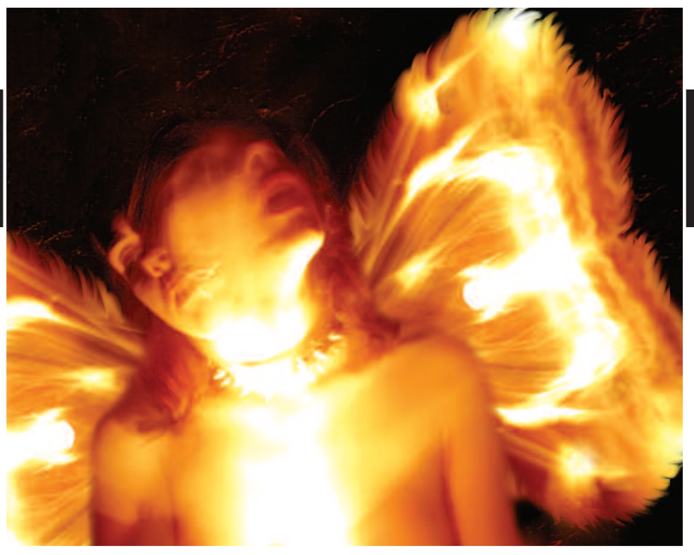
▲ Soul of a Moth, 2004 (painted with light and digital manipulation).

Depression is an illness that is spreading very rapidly among young adults. These young adults are part of what has been called "Generation X," a generation that many have classified as apathetic and without ideals, but without asking the reason. A large number of people in this generation might be depressed.