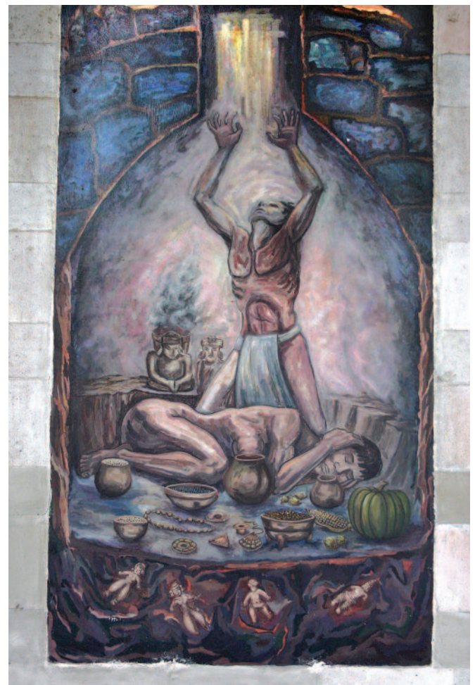
Mural at the Government Palace (detail).

After independence, the criollos replaced the Spaniards as dominant and political matters underwent severe changes. In 1824, the State of Mexico was founded with Mexico City as its capital. But on November 18, Mexico