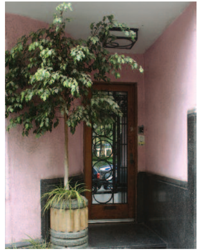
Ironwork on entrances to buildings on Amsterdam Avenue.

arenas. The Condesa race track was inaugurated October 23, 1910, with the cream of Mexican society in attendance, elegant gentlemen and fine ladies in their best clothing. The entrance was located on what is now Nuevo León Avenue and the stands on what was later to become the intersection of Parras and Amsterdam Avenue. The outbreak of the Revolution meant that the race track only operated a short time, and in the next few years it was used as a stadium for sports and military events, motorcycle and automobile races (in which the vehicles went as many as 75 times around the track). On November 18, 1924, the Jockey Club signed a contract with the Hipódromo de la Condesa Land Development and Construction Company to divide up, urbanize and sell the land on which the former race track had stood.