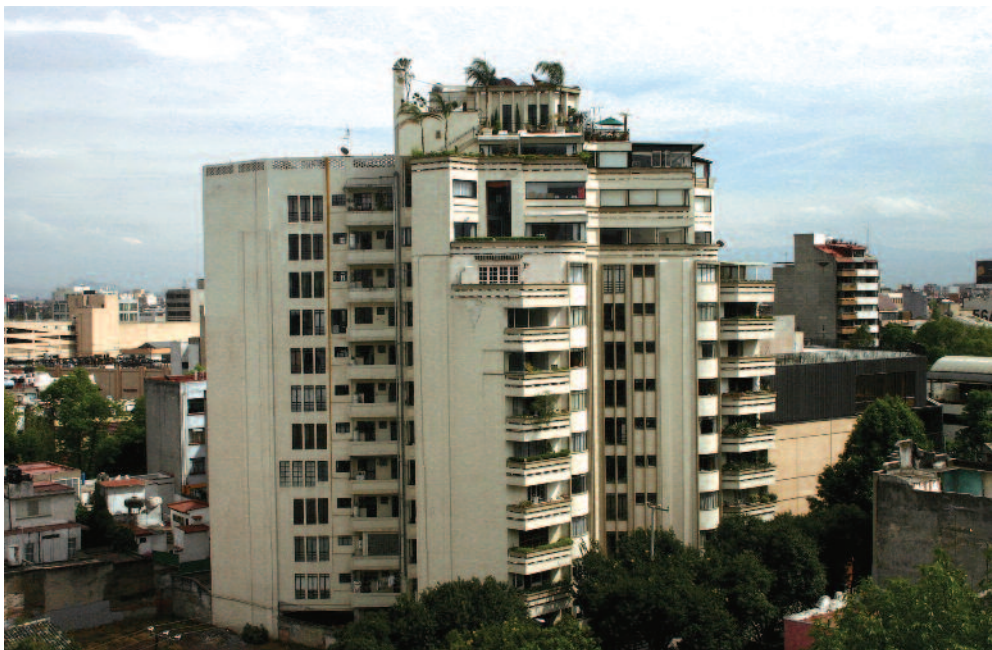
The Basurto Building.

The Hipódromo neighborhood was also fertile ground for developing a new architectural concept that came from Europe, rationalism, known in Mexico as functionalism. Internationally renowned Mexican architect Luis Barragán built a couple of houses in this style on Mexico Avenue. The Basurto building was built between 1942 and 1946. Its splendid horseshoe-shaped lobby reaches 11 stories upward. An excellent example of the architectural style similar to “ships run aground” that emerged in the 1930s can be seen in the Armillita building, originally owned by the famous bullfighter Fermín Espinosa. It was built in 1939 and still preserves the pergolas