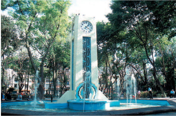
Column Clock in Mexico Park.

of its roof garden. The colonial Californian style, fully developed in the Polanco neighborhood, one of Mexico City's most exclusive areas, was first seen in the Hipódromo area, where there are still numerous houses with the decorative elements of this current: spiral-shaped columns on terraces and windows, baroque frames, mixed curved and straight-edged caps and tiled gabled roofs.