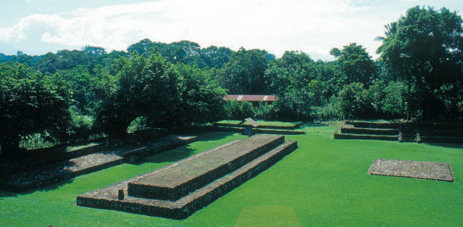
Ball game court at Izapa 1 archaeological site.