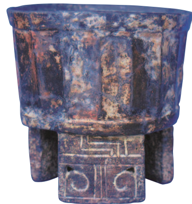
Three-legged Teotihuacan-style vessel with battlement-shaped legs. Early Classical.

SOCONUSCO ARCHAEOLOGICAL MUSEUM 8 AVENIDA NORTE # 24, BETWEEN 1 AND 3 PONIENTE TAPACHULA, CHIAPAS PHONE: (962) 626 4173 OPEN: TUESDAY TO SUNDAY, FROM 10:00 A.M. TO 5:00 P.M.