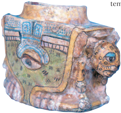
Efigie receptacle with the image of a warrior whose head is the top. Plomiza ceramics. Early Post-classical.