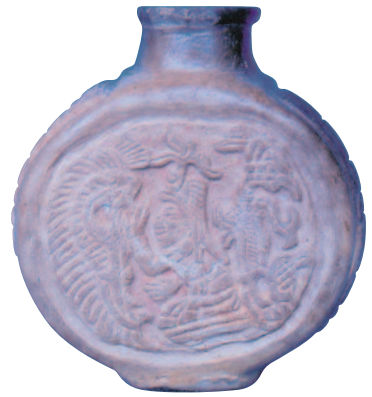
Bottle with images and hieroglyphics characteristic of the Mayan area.