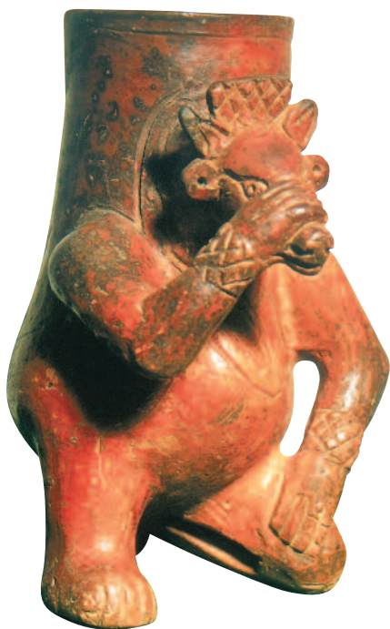
Vase with the figure of a coati holding its muzzle. Plomiza ceramics. Early Post-classical period.

Although traditionally the Pacific Coast of Chiapas is considered part of the Mayan area, strictly speaking, archaeological and linguistic evidence show that the region was actually inhabited in ancient times by members of the Mixe-Zoque linguistic group. Mayan does not belong to this group, but the language of the culture we now call Olmec may well be part of it.