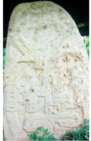
Stelae 11 found in complex B, Izapa.

During the late nineteenth and the early twentieth centuries, large, mainly German-owned, haciendas were established in the region. In that same period, large groups of Asian immigrants crossed the Pacific and arrived on the Chiapas coast. Today, the region is a port of entry for many Central American emigrants who for different reasons have settled there. All these actors define the make-up of today's inhabitants of Soconusco. NM