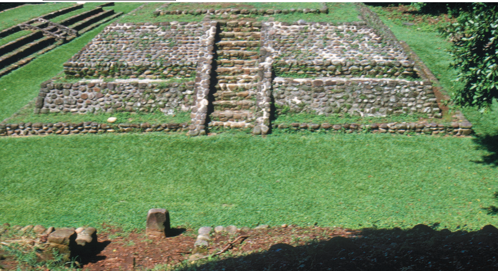
Izapa A archaeological site.