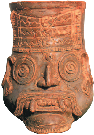
Plomiza ceramic receptacle with the image of the god Tlaloc. Early Post-classical.