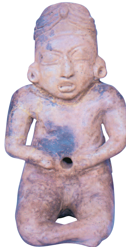
Late Pre-classical figurine from Izapa.

About 1200 B.C., the population of Soconusco received a big cultural impact from the Olmec metropolitan area. The presence of traits of this first great civilization is clear in several objects studied and recovered in the region. One example of this is the pottery and some of the stone sculptures from Izapa on exhibit at the Soconusco Archaeological Museum in Tapachula.