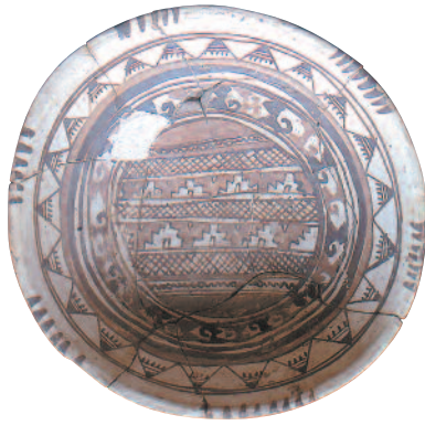
Three-legged plate with eagle-shaped legs. Late Post-classical.