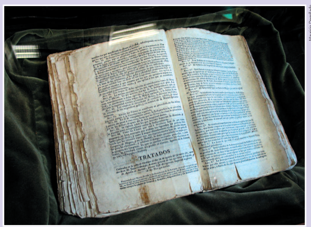
Exact copy of the Treaties of Córdoba in the Municipal Palace.

ordoba is a privileged city. Strategically located in central Veracruz, it is within a stone's throw of the port of Veracruz on the Gulf of Mexico and an easy distance from Puebla and Mexico City in Central Mexico. Its semi-warm, humid climate has given birth to fertile lands and majestic scenery. Its past includes one of the most important mo-