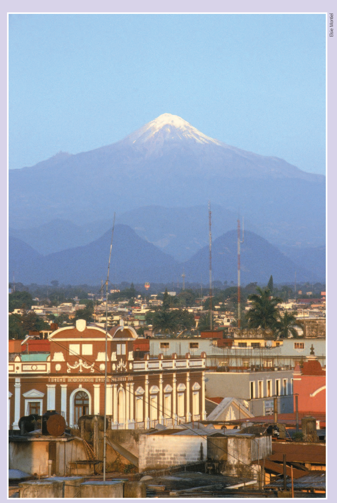
The Orizaba Peak guards the city's horizon.