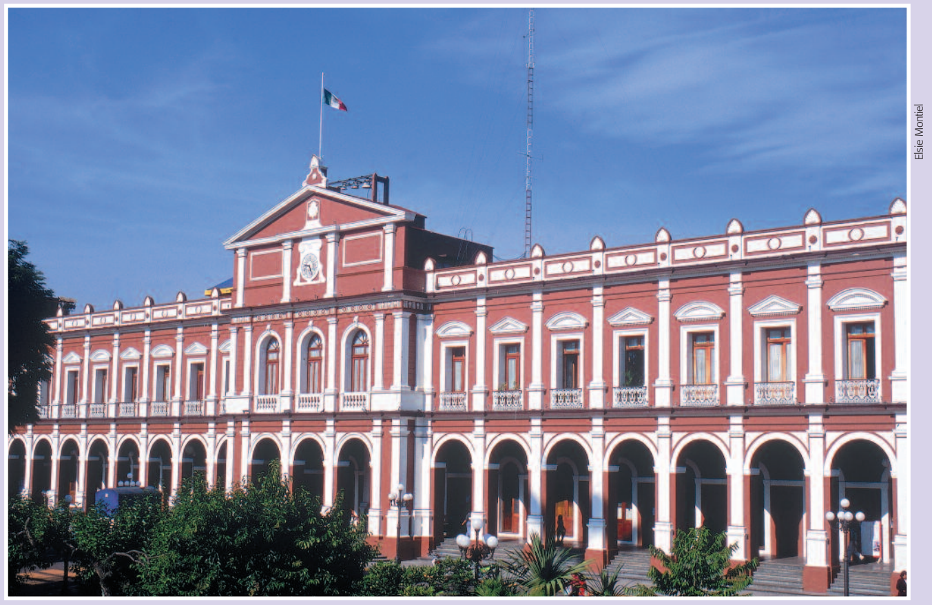
The neoclassical municipal palace's 21 columns commemorate the May 21, 1821 battle.

The classical colonial portals, with their semi-circular arches, are the doorways to buildings that housed viceroys, emperors, presidents and great figures from the past.