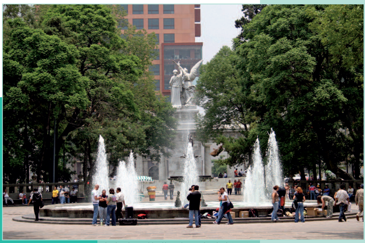
The Alameda, one of the oldest and most traditional parks in Mexico City.

Undoubtedly, however, the avenue's crowning jewel is the old Corpus Christi Church which today,