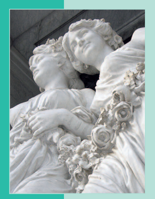
Left: The Palace of Fine Arts. Right: Detail of the facade.

The beautiful Corpus Christi Church is now surrounded by modern buildings on the glamorous Juárez Plaza, which occupies the enormous space that had been left in ruins after the 1985 earthquake. Finally, five years ago, it began its transformation with the restoration of the old baroque church and the construction of buildings to house the Ministry of Foreign Relations and the Superior Court, which occupy two beautiful towers designed by Ricardo Legorreta, one of Mexico's foremost architects. An impressive fountain designed by Vicente Rojo, formed by dozens of small metallic pyramids surrounded by bubbling water and an enormous mural-sculpture of small colored mosaics by painter David Alfaro Siqueiros, decorate the complex.