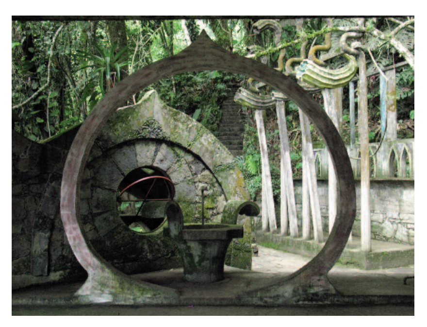
Nothing is useful in Las Pozas, but it is all beautiful. There is no premeditation, but there is mystery.

macaw on his shoulder, imagining new impossible forms, thinking about how to populate his imitation cement jungle, his invisible, labyrinth, ecstatic