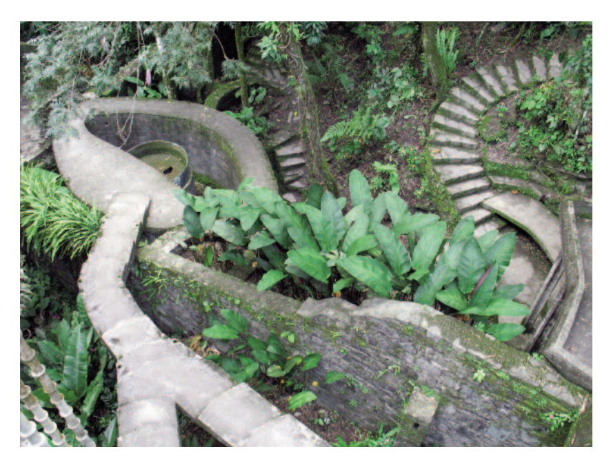
Las Pozas surprises you as you suddenly find yourself faced with a cliff next to columns that look like bamboo plants.

Between the eleventh and thirteenth centuries, the Huastecs were invaded by groups of nomadic, hunting and gathering Chichimecs from the north. By that time the golden age of the