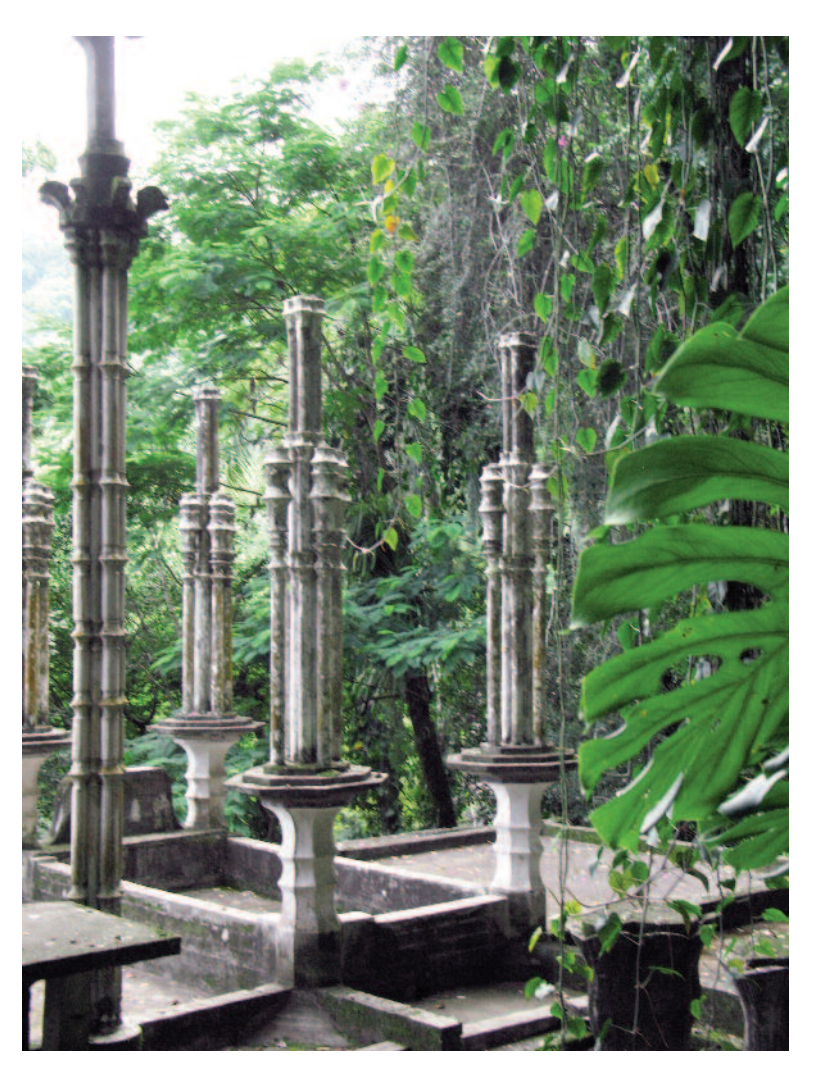
Xilitla's Las Pozas is something different. Let's call it a whim, or perhaps the largest outdoor surrealist monument ever conceived.

In addition to its pre-Hispanic and colonial past, in Xilitla there is a place that might seem like the vestige of any of the aforementioned ancient civilizations, but in reality is not. Xilitla's Las Pozas is something quite different. Let's call it a whim, or perhaps the largest outdoor surrealist monument ever conceived. Here, the paintings of Escher, Giovanni Battista Piranesi, Remedios Varo or another