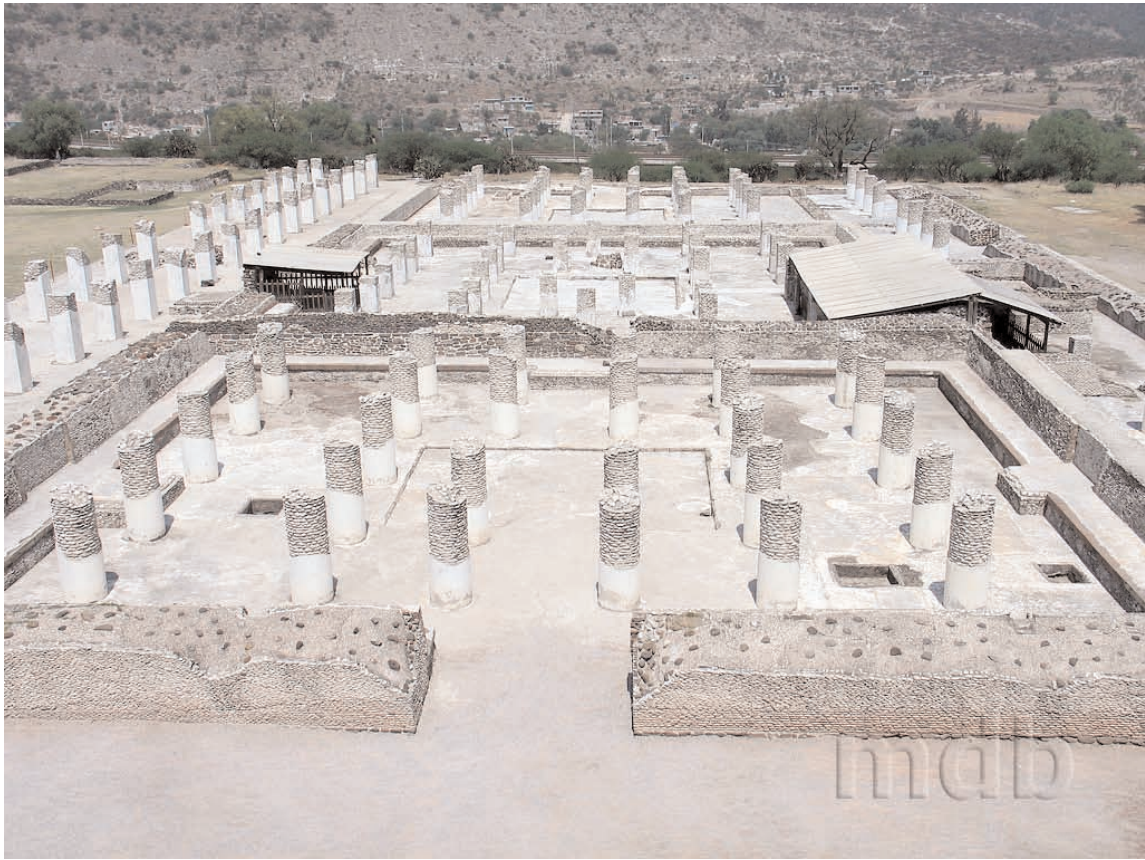
Panoramic view of the Burned Palace from the top of Pyramid B.

named Tohueyo (a name which refers to the thumb, sex and being foreign). But actually, Tohueyo was the god Tezcatlipoca in disguise. The first chance he had, Huémac sent his son-in-law to war with the idea that he would be killed, but that did not happen: Tohueyo returned triumphant from that and other battles.