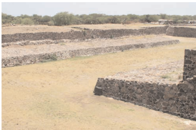
Ballgame court 1.

Different Nahua peoples are the source of the invention of the toltecáyotl (the Toltec): the essence of being an inhabitant of a fabulous city and wise man and artist par excellence .