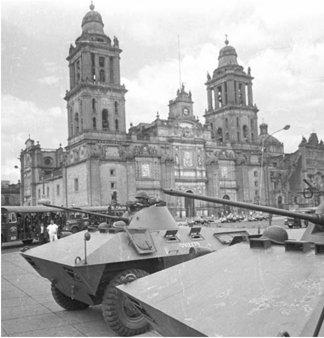
Tanks occupying the center of the city in August 1968.