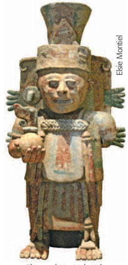
beads and other ornaments from different parts of Yucatán.