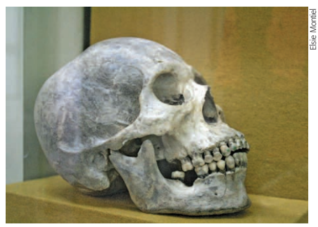
Intentionally deformed skull with jade-incrusted teeth, from Jaina, Campeche.

entryway, with its marvelous scene of two hunters returning from the hunt with their prize, a deer.