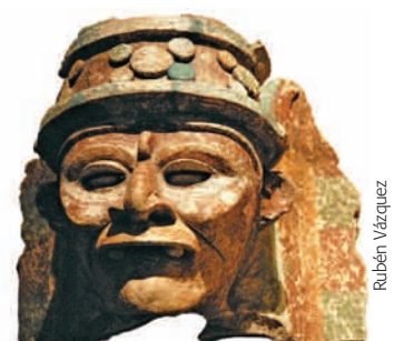
Fragment of an incense-burner from Mayapán.

Another topic that has developed greatly in recent years is the Mayan world view. In