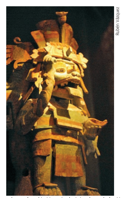
Incense-burner found in Mayapán depicting the god of writing.

In recent years, in response to a public increasingly interested in understanding the past and viewing the new discoveries of archaeological projects, the number of pieces has practically doubled, reaching almost 1,000. Among the