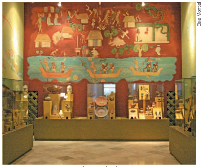
Room with items related to trade.

The Cantón Palace is not only witness to and a disseminator of the peninsula's ancient history, but also more recent events. Once in the hands of the state government, it became the Fine Arts School. Then, in the 1940s, it was turned into the Hidalgo Primary School, and the principal and his family lived in it to take care of it; the attic was the dormitory for students boarded there.