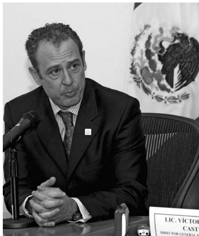
Mexico's ambassador in the United States.

LC: You could count 13 minutes of applause, and another noteworthy thing was the way the president was treated. Mr. Am-